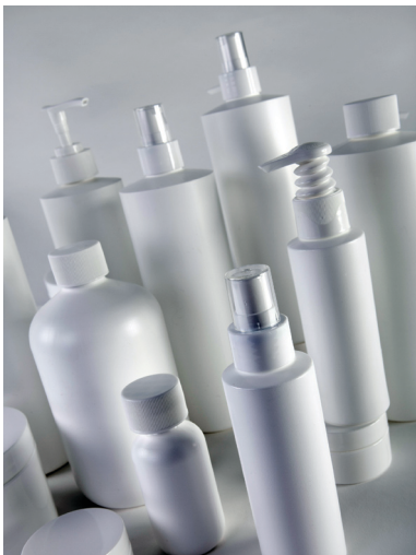
Low-molecular-weight phthalates are found in many personal care products.

The behavioral problems assessed in this study are relevant to conditions such as oppositional defiant disorder, conduct disorder, and attention deficit/hyperactivity disorder. Diagnosing these conditions requires extensive testing beyond the scope of this study. Furthermore, this study cannot confirm that phthalate exposure caused these problems via altered thyroid function—or any other mechanism. However, thyroid-related phthalate toxicity makes a connection biologically plausible and underscores an urgent need to further investigate the effects of phthalates on neurodevelopment.