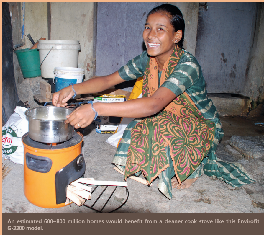
An estimated 600–800 million homes would benefit from a cleaner cook stove like this Envirofit G-3300 model.

The initiative will also include an accreditation component. Knowing the health effects of different concentrations of smoke will give international agencies and governments the data necessary to establish “clean cook stove” standards that manufacturers must reach to be accredited. This ensures that customers who purchase an accredited “clean cook stove” can expect certain improvements in fuel use and reductions in indoor air pollution levels, says Anchan.