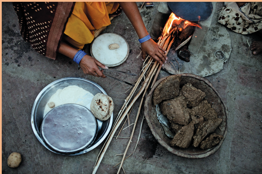
Siyaram Sikarwar cooks with a fire made from wood and cakes of cow dung at her home in Kolma, Uttar Pradesh. Around the world, women and children can spend up to several hours each day collecting these and other solid fuels to fire traditional cook stoves. The WHO estimates that breathing the smoke from traditional cook stoves and open fires caused nearly 2 million premature deaths worldwide in 2004, the most recent year for which there are data.

imparting a delicious flavor to the food that many Indians love. But everyone—from the women cooking their meals to international health experts—knows the smoke from the fires has a dark side, literally and figuratively.