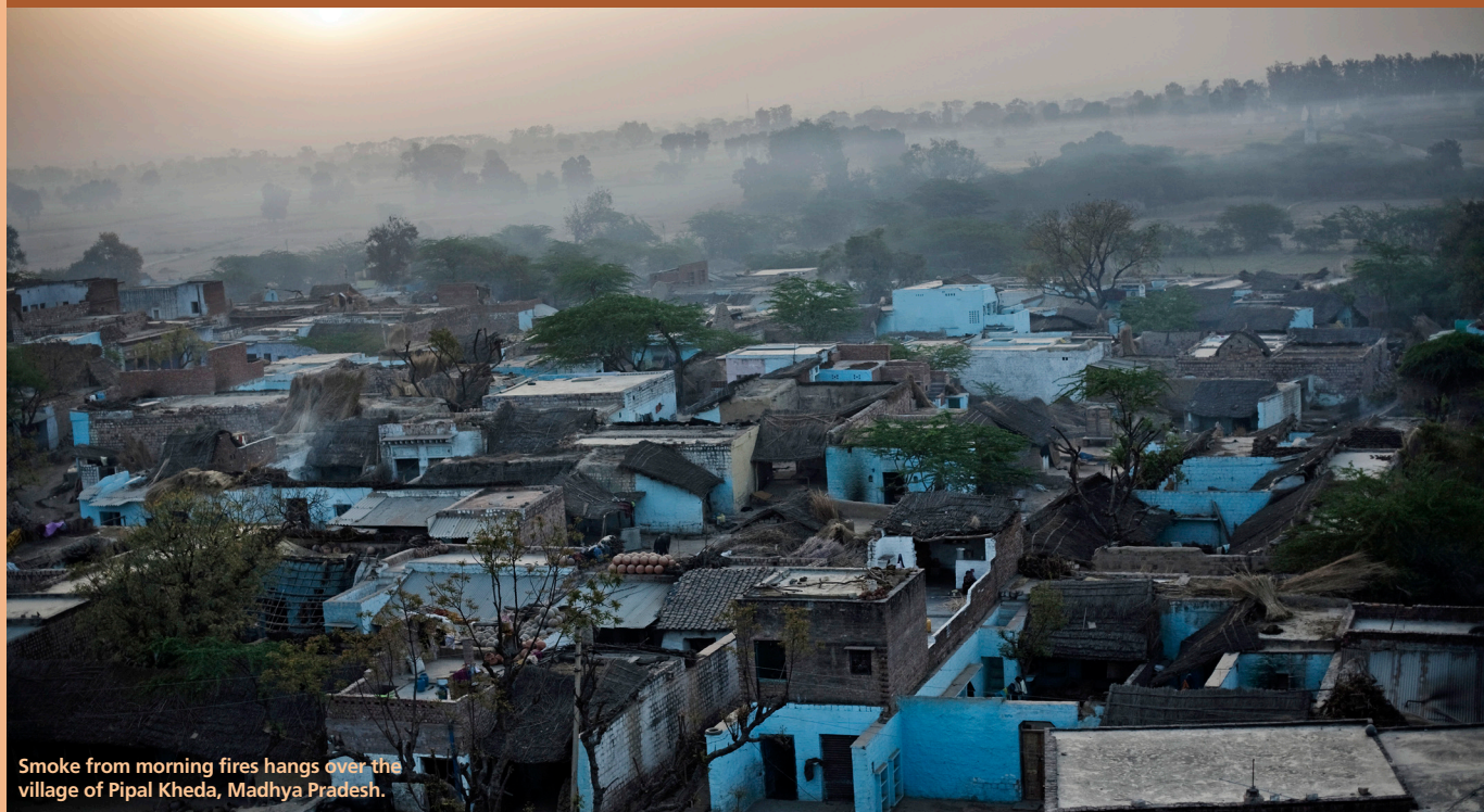
Smoke from morning fires hangs over the village of Pipal Kheda, Madhya Pradesh.