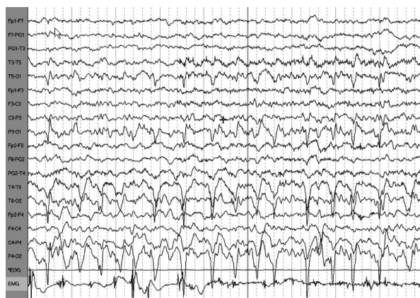
Figure 2. EMG silent periods lasting up to about 400 ms appear irregularly, interrupting the ongoing interferential recorded from the left extensor muscle. The silent periods are time-locked with the epileptic discharges recorded from the contralateral parieto-temporal region.