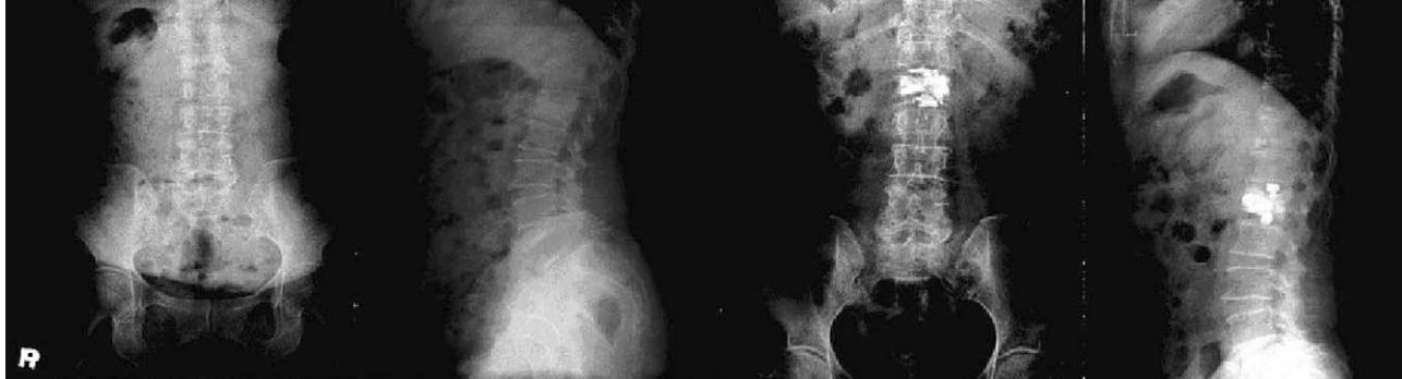
Fig. 2. Sixty-three female, fall 10 weeks prior, senile burst fracture of L1.