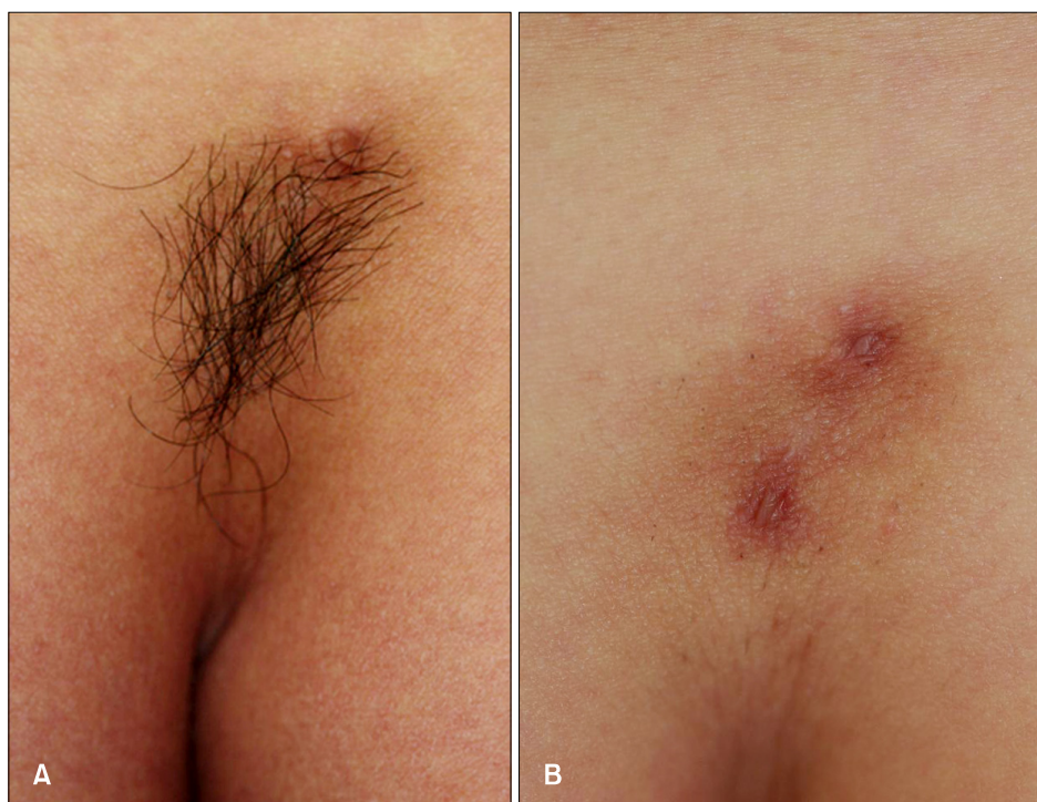
Fig. 1. (A) A localized reverse triangular shaped hair tuft with terminal hairs on the lumbosacral area. (B) The area after 3 treatment sessions with intense pulsed light (IPL) at 3 week intervals.