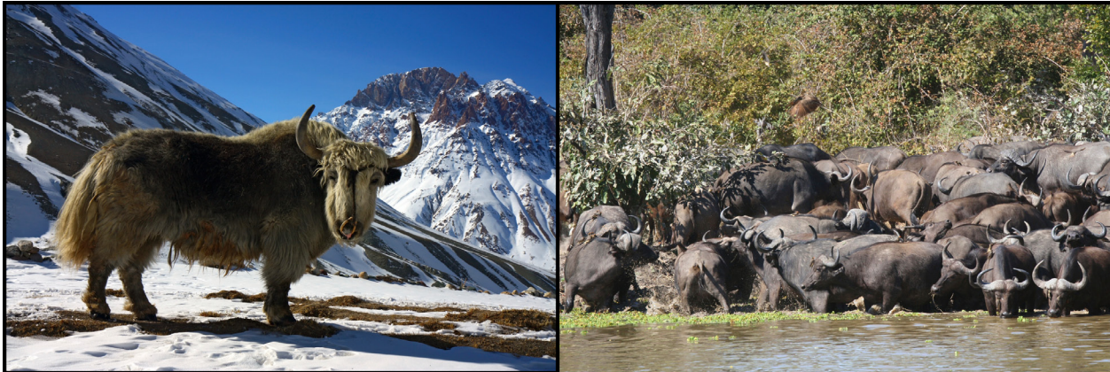
Figure 1. Bovini stand apart from other antelopes (Bovidae) in the wide range of environments they inhabit, from high montane to wet tropical. Bovini today comprises 12 species found on four continents. (Yak: iStockphoto.com/kodda; African buffaloes: iStockphoto.com/dawnn).