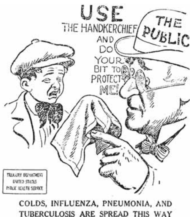
Figure 5. Poster distributed by U.S. Public Health Service, 1918