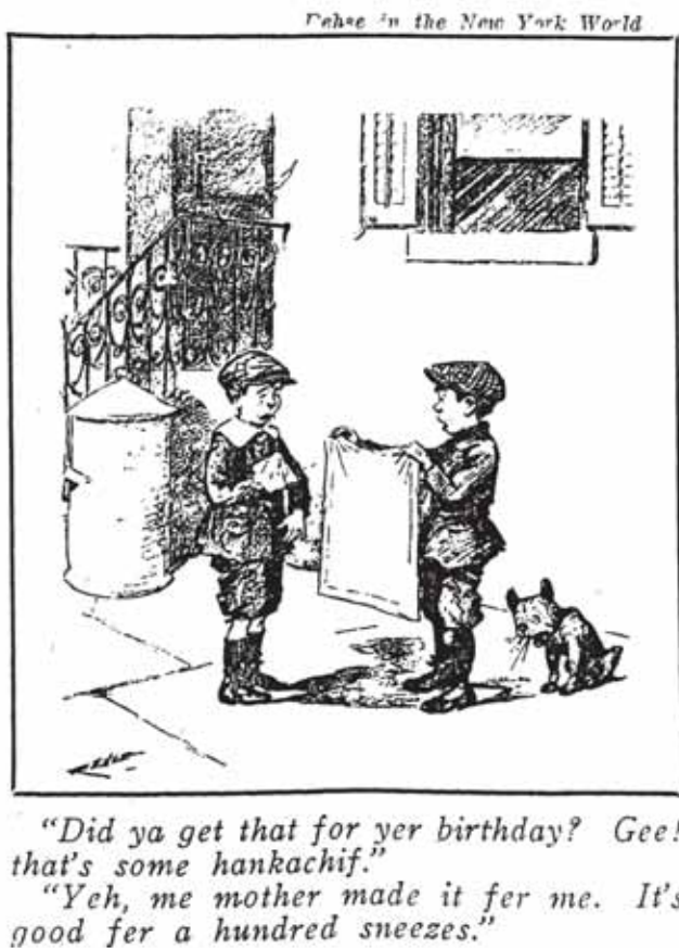
Figure 6. Cartoon attributed to George Rehse of the New York World

Source: Reprinted in: Spanish influenza and its control. Survey 1918 Oct 12;41:45.