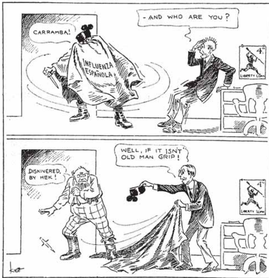
Figure 1. "The Mysterious Stranger": a cartoon in the Dallas News during the 1918–1919 influenza pandemic