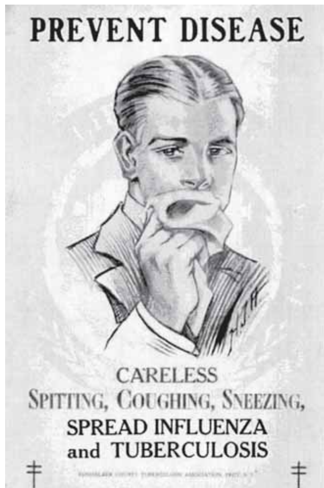
Figure 4. Poster distributed by Rennselaer County Tuberculosis Association, Troy, New York, 1918