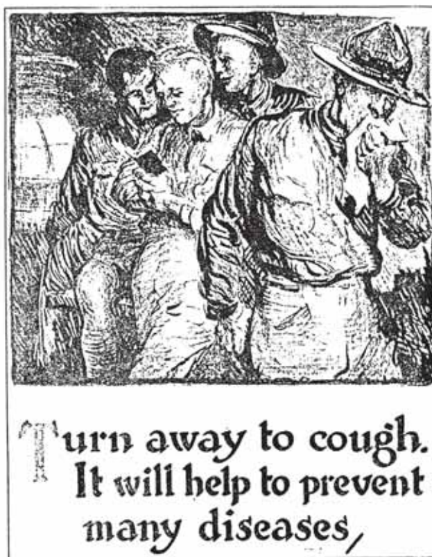
Figure 3. Poster distributed by National Tuberculosis Association, 1918

Poster by National Tuberculosis Association