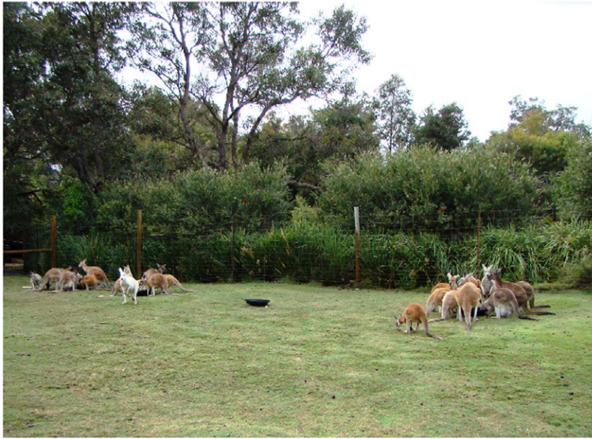
Figure 3. Cafeteria trials. Western grey ( Macropus fuliginosus ), red kangaroos ( Macropus rufous ) and agile wallabies ( Macropus agilis ) participating in cafeteria trials in Caversham Wildlife Park, Whiteman, WA. The treatment (dingo urine) is located beside the trough in the centre. Other treatments (feces, water) were rotated among troughs and position and differed according to day. doi:10.1371/journal.pone.0010403.g003

model in SPSS version 11.5 (SPSS Inc., Chicago, IL, U.S.A.) to all response variables. Tukey's HSD post hoc analysis was applied to within-subject treatments (e.g., urine, feces, control). A linear regression was fitted to assess whether elapsed days explained variation in participation rate. We calculated d -scores [51] to identify effect size of comparisons between treatments. All tests were two-tailed, we set our \alpha = 0.05 . Means are given \pm SEM.