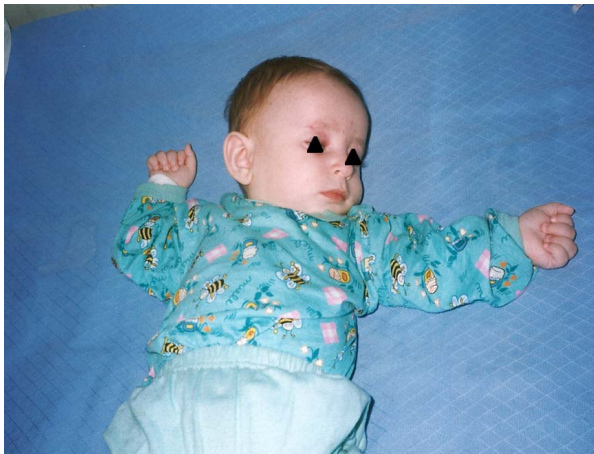
Figure 1 Subtle finger tremors. A five months old boy with Angelman syndrome and drug resistant infantile spasms.

a "de novo" interstitial deletion, involving the long arm region of the maternally inherited chromosome[5]. In a low percentage (3%) AS is linked to a paternal uniparental disomy (UPD) in that the child has inherited both chromosomes 15 from the father[6]. AS may also derive from imprinting defects (ID) during gametogenesis [7]. Another genetic mechanism was identified in the occurrence of mutations of the maternal UBE3A gene[8]. This gene encodes the E6AP-3A ubiquitin protein ligase involved in brain protein degradation[9]. Maternally imprinted in the brain, it is expressed in cerebellum Purkinje cells, olfactory tracts and hippocampus[10]. UBE3A anomalies are present in 85% of AS with familial recurrence and 15 -23% of sporadic ones. De novo mutations occur in 70% of cases. A high incidence of gonadal mosaicism has also been observed interesting both maternal and paternal germline.