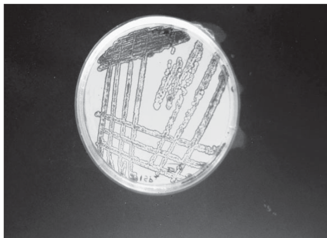
Fig. 1: Growth of strain D10 on ISP2 agar Growth of actinomycete strain D10 on yeast extract malt extract agar

All the clinical bacterial isolates and their antibacterial susceptibility data were obtained from the Department of Microbiology, Sri Sankara Arts and Science