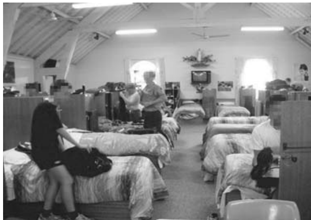
Fig. 1. One of the affected dormitories.

IgG GMC of the symptomatic and asymptomatic groups. Wilcoxon matched-pairs signed rank sum was used to test the statistical significance of differences in PT IgG GMCs between paired serum samples.