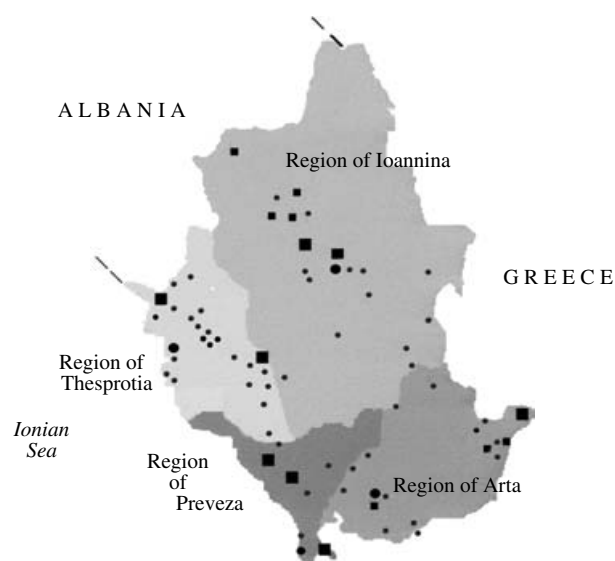
Fig. 2. Geographic distribution of brucellosis cases. •, 1–2 cases; ■, 3–5 cases; ■, 6–10 cases; ●, regional capital.

the lowest in the District of Ioannina (11.8 cases/10 5 inhabitants). The geographical distribution of the cases of brucellosis is shown in Figure 2.