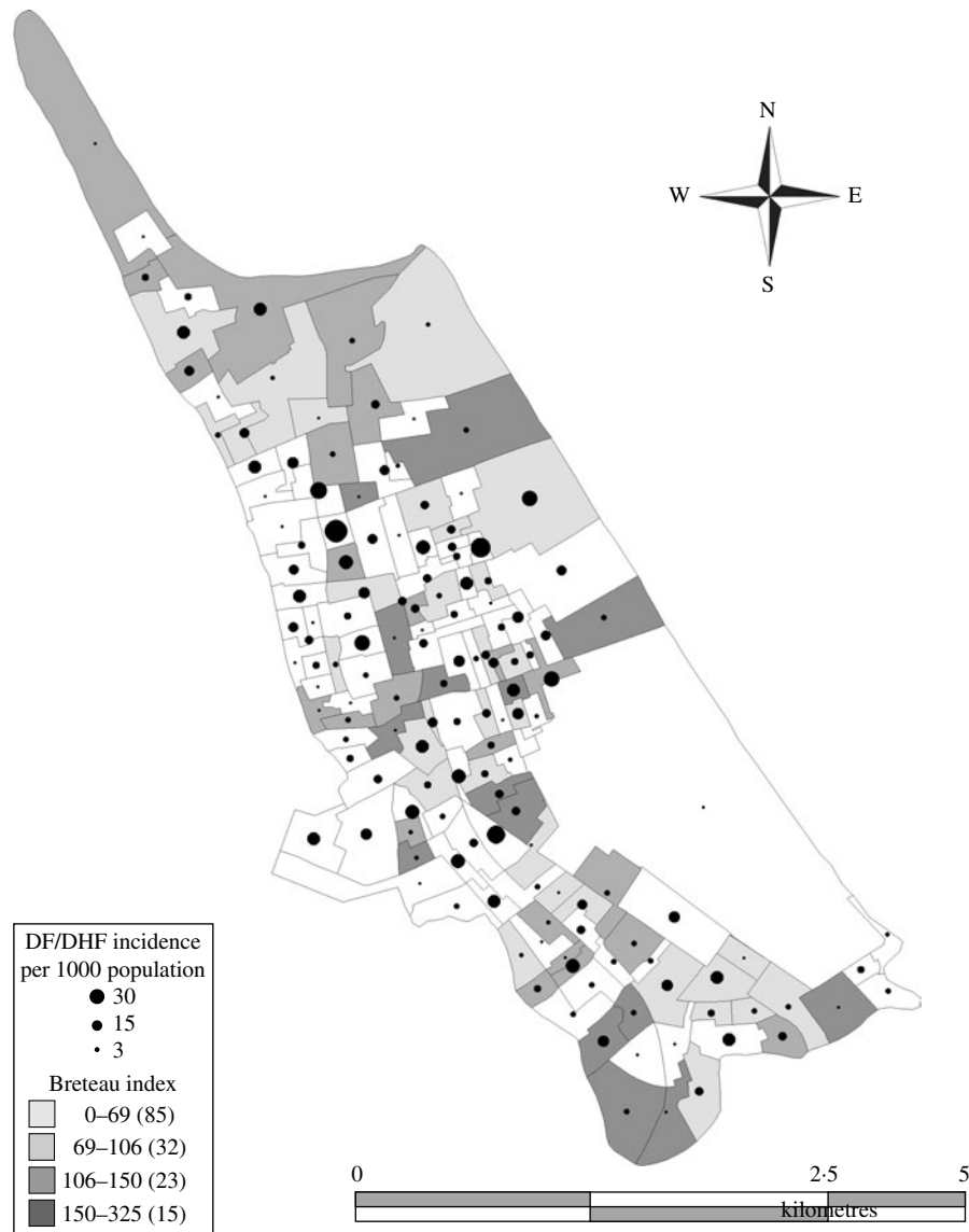
Fig. 3. DF/DHF incidence/1000 population and the Breteau index in Songkhla municipality ( r = -0.17 , P = 0.03 ).

houses, brick-made houses and houses with poor garbage disposal and had a negative correlation with the average number of people per house, percentages of single houses, slum dwellings, wood-made houses and the Breteau index as shown in Table 1. There was a low negative correlation between the DF/DHF incidence and the Breteau index as shown in Figure 3 whereas the percentage of houses with poor garbage disposal was positively associated with DF/DHF incidence (Fig. 4). The potential housing risk factors showed no significant clustering except slum dwellings and empty houses (Table 2). The best model for predicting DF/DHF incidence contained only a percentage of shop-houses, brick-made houses and houses with poor garbage disposal (Table 3).