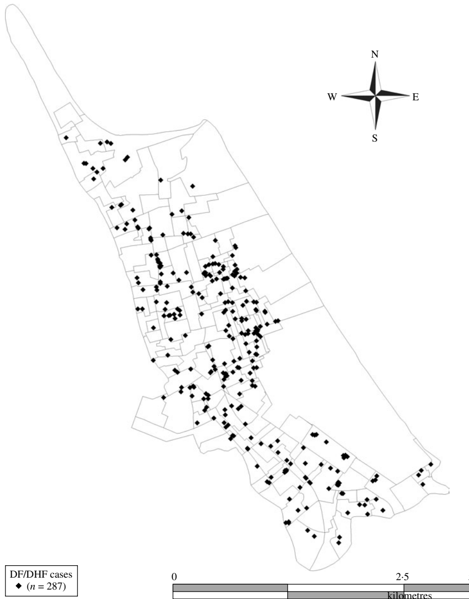
Fig. 1. Distribution of DF/DHF cases in Songkhla municipality (nearest-neighbour analysis Z = -8.03 , P < 0.0001 ).