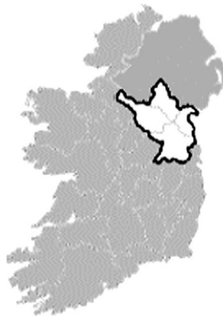
Fig. 1. Map of Ireland (showing NEHB counties in white).

The HIPE dataset presents a valuable means of retrospectively assessing notifiable infectious disease hospitalizations. Indeed, these hospitalizations represent the most severe illnesses due to notifiable diseases and therefore warrant an extra onus on hospital clinicians to notify. The aim of this study, therefore, was to determine for one health board region in Ireland, the level of hospitalizations due to notifiable infectious diseases and to compare these hospitalizations with notifications for the same period to examine whether or not there was any substantial under-reporting of these diseases by hospital clinicians.