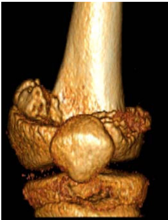
Figure 4 Sibling A - Reconstituted CT of left distal femur collapse/impaction, aged 10.

follow-up with the other two siblings. Initial x-ray screening for disease did not find any hip or lower limb bone disease. He suffered his first bilateral clavicular fracture at age 7 after falling whilst playing football. Unusually, he reported feeling some initial pain but continued to play football after sustaining the fractures. These fractures were managed conservatively, and healed slowly with large callous formations at each fracture site. Following this, he had recurrences of clavicular fractures thereafter.