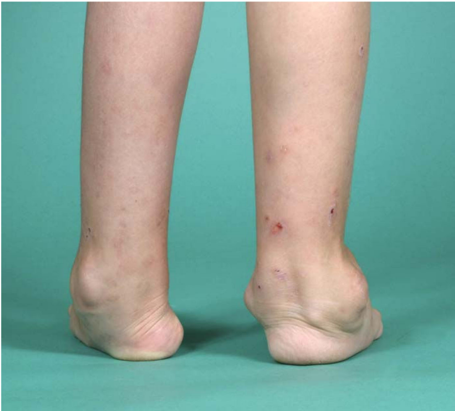
Figure 6 Sibling A - Clinical photos (anterior and posterior aspects) showing deformities of both ankles and feet, aged 10 1/2.