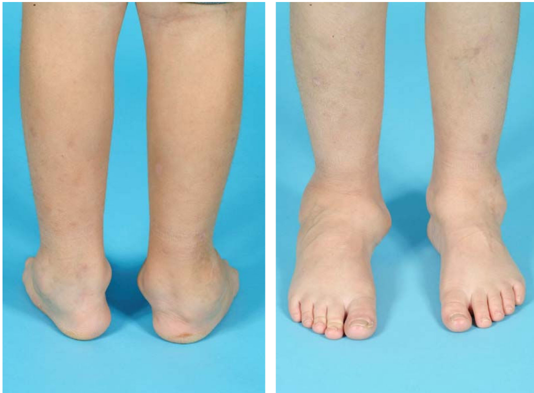
Figure 3 Sibling A - Clinical photos (posterior and anterior aspects) showing bilateral deformities in both feet and ankles, aged 9.