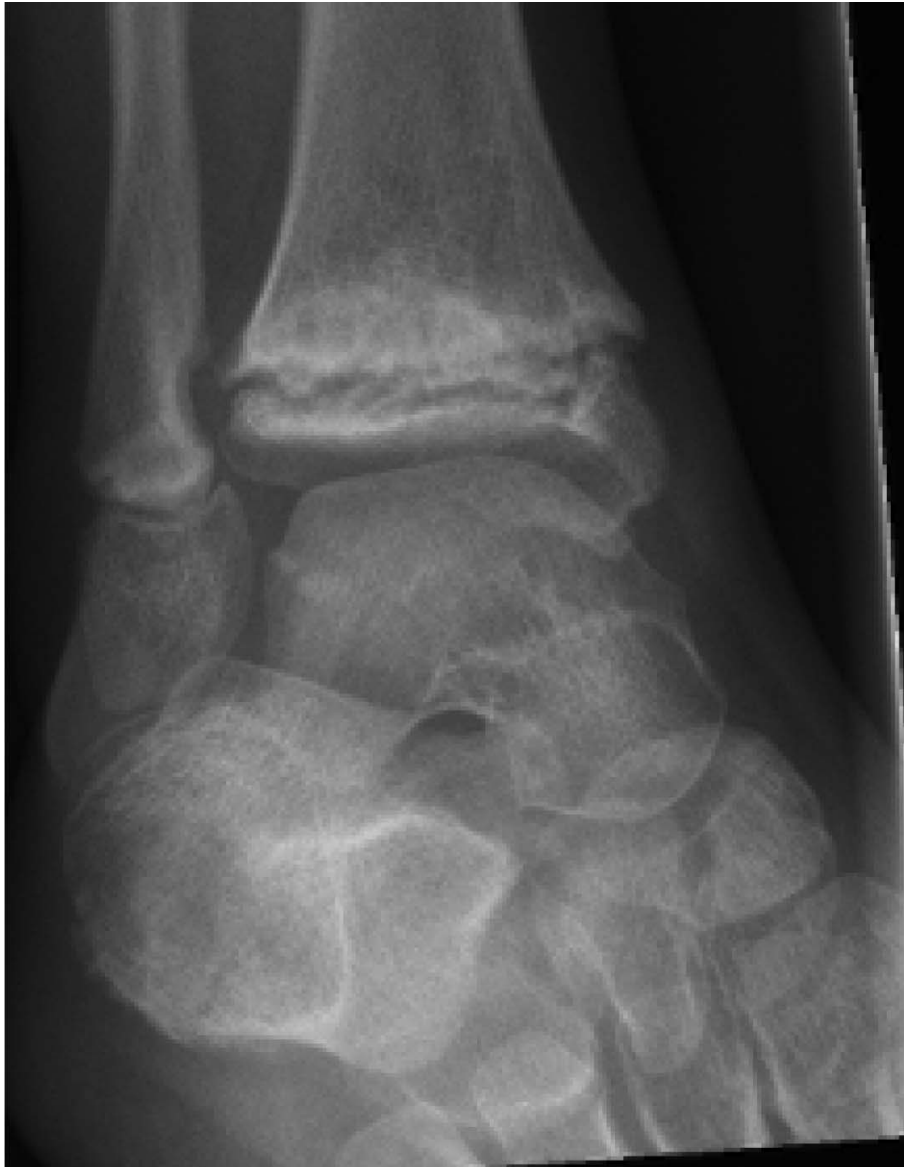
Figure 8 Sibling C - X-ray of right ankle showing abnormal osteolytic process of epiphyses of distal tibia and fibula, aged 8 yo.

natural history or progression of the disease. We could not comment on the effects on fracture risk as one sibling developed a significant fracture post-bisphosphonate, even following an improvement in BMD. Similarly, we could not comment on whether bisphosphonates reduce the risk for further surgical intervention as one sibling required stapling to correct leg length discrepancy. Bisphosphonate therapy in these three siblings seemed safe, as reported side effects were mild and clinically insignificant. Given that the treatment options for conditions such as IMO are limited, we conclude that bisphosphonate therapy could