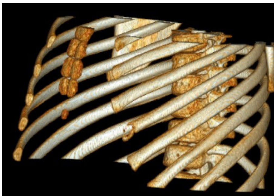
Figure 7 Sibling B - CT Chest showing osteolysis of the left 6 th rib, aged 10 1/2.

left proximal femoral shaft [Figure 9]. The fracture was treated with traction. We continue to follow her progress.