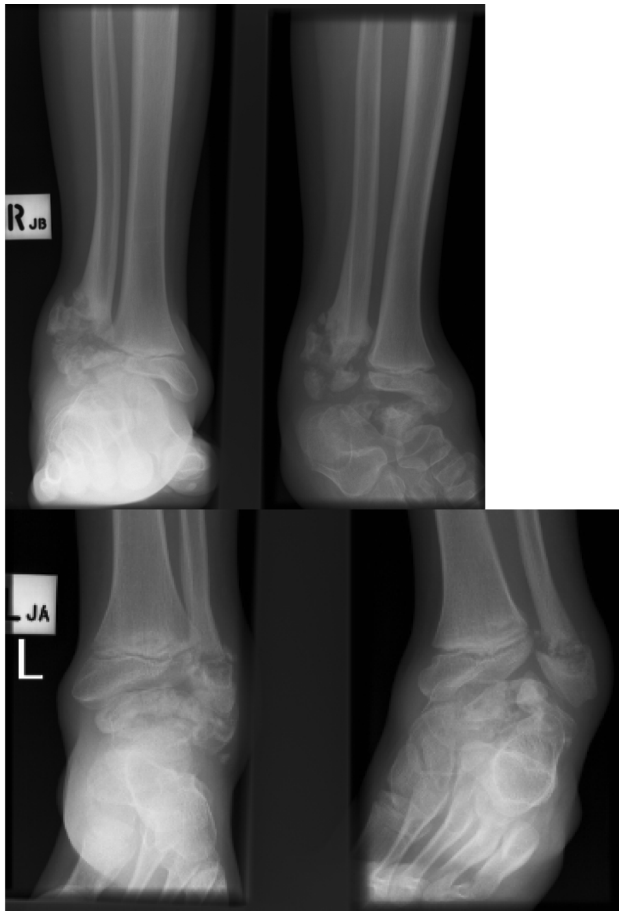
Figure 2 Sibling A - Bilateral fragmentation and progressive bony destruction of the distal fibula, with tibial sparing. Disintegration of both tali. Aged 8 1/2 years.

Left femoral head BMD scores improved from 0.43 (z -3.01) to 0.81 (z -0.7). Only a minor transient self-resolving fever was observed during the infusion. There were no other reported side effects.