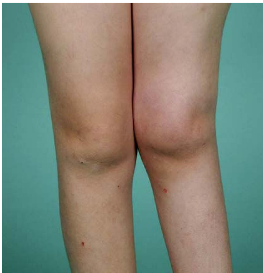
Figure 5 Sibling A - Clinical photos showing severe valgus of her left knee and shortening of femur, aged 10 1/2.

the time of writing, duration of treatment with bisphosphonates is 3 months, hence it is too early to fully analyse other outcomes and effects from bisphosphonate therapy. No adverse effects from therapy were reported.