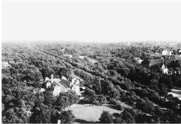
Figure 1. The Biologische Versuchsanstalt The “Prater Vivarium” is depicted in the left foreground as seen from the Riesenrad, Vienna’s giant ferris wheel.