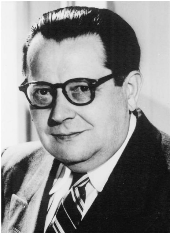
Figure 4. Ludwig von Bertalanffy (1901–1972)