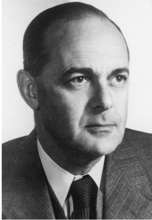
Figure 3. Paul Alfred Weiss (1898–1989)