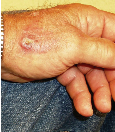
FIGURE 1: Clinical picture.

central umbilication could also suggest keratoacanthoma or a lesion caused by molluscum infection though such lesions are usually much smaller. Milker's nodules should be considered too. Both the clinical history of sheep farming and the microscopic features including the eosinophilic intranuclear inclusion body in the keratinocyte suggest a diagnosis of human orf (ecthyma contagiosum). The diagnosis may be further confirmed by electron microscopy done on the fluid obtained from the orf lesion showing ovoid cross-hatched virions [1]. Polymerase chain reaction (PCR), although not readily available, can definitely identify orf virus from frozen tissue specimens, vesicle material, or scab debris from orf lesions [2].