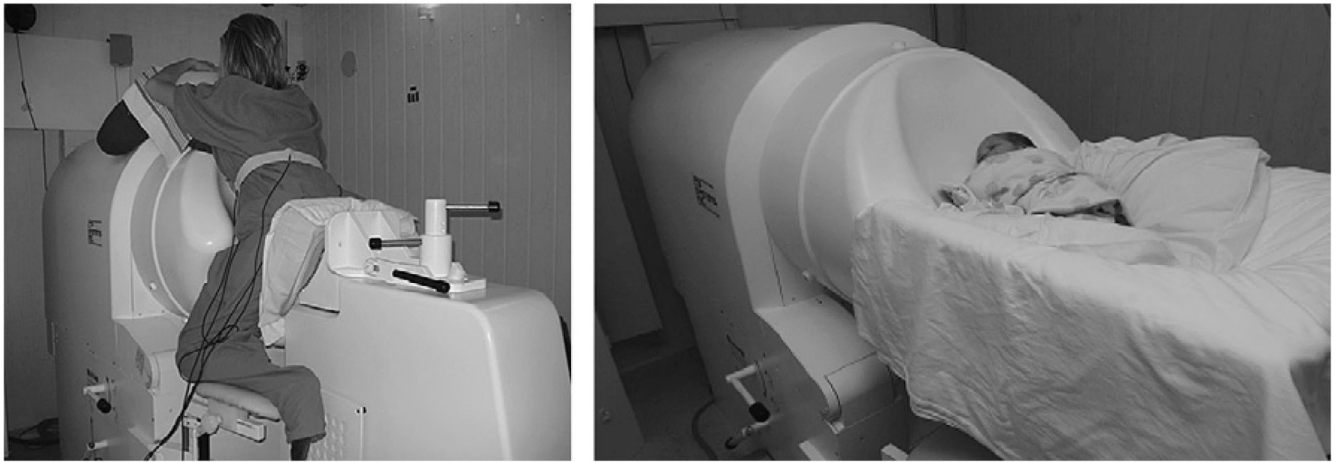
Fig. 1. The left panel shows a pregnant subject seated on the SARA system. The right panels shows a neonate positioned in the cradle for a study.