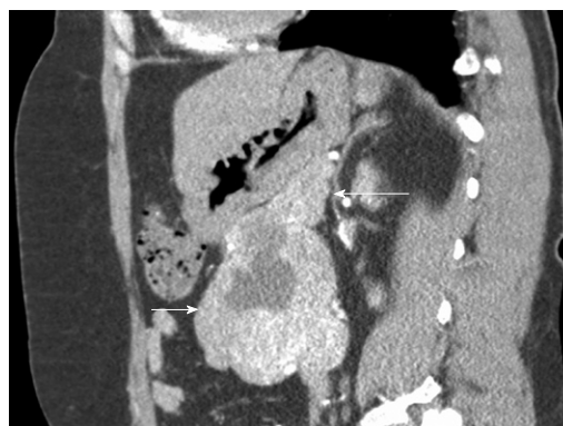
Figure 2 GIST located on the horizontal duodenum (patient 5, Table 1). Note the close relation between the GIST (short arrow) and the pancreas (long arrow), which was easily dissected during surgery.