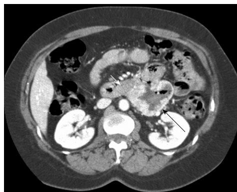
Figure 1 Gastrointestinal stromal tumor (GIST) located in the third part of the duodenum with typical computed tomography (CT) appearance. Note the typical CT appearance of GIST with an area of necrosis (central cavitations with surrounding highly vascular tissue) (white arrow: pancreas; black arrow: GIST).

Statistical analysis was performed using GraphPad InStat