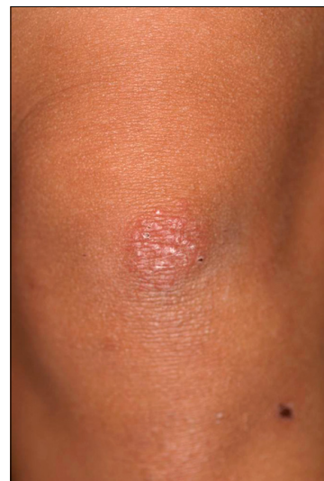
Fig. 1. An erythematous patch, 2.5 cm in diameter, was composed of multiple flat papules on the left knee.

Several minutes after coming in contact with hard coral in the Gulf of Thailand, South China Sea, a 28-year-old