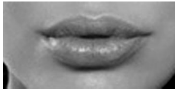
Figure 2 A photograph of a youthful lip, demonstrating fullness, slight eversion of the lower lip, visibility of the wet-dry junction of the lower lip, and preserved vertical rhytides.

Another example of a potential change in minimally invasive procedures was demonstrated in the study of the deep medial fat compartment of the cheek by Rohrich et al. 19 When saline was injected into the deep