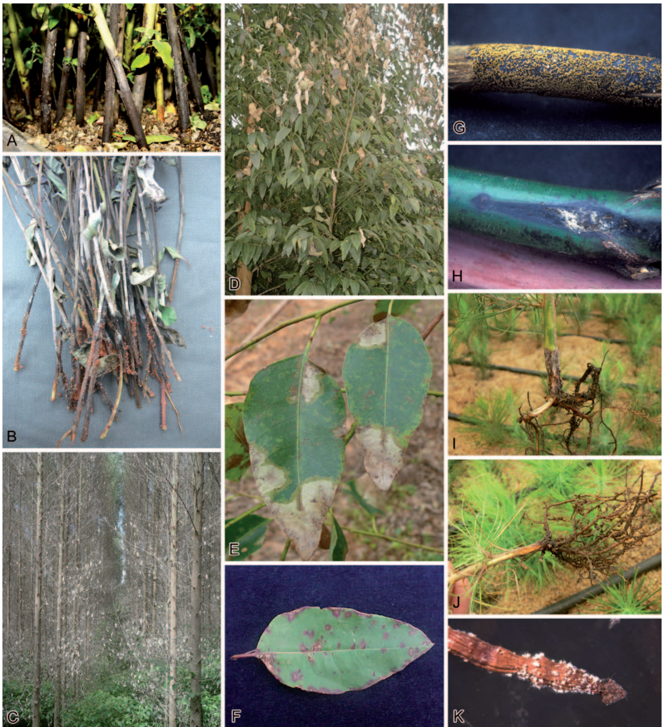
Fig. 1. Disease symptoms associated with Calonectria ( Cylindrocladium ). A. Cutting rot of Vallea stipolaris . B. Cutting rot of Eucalyptus sp. C. Defoliated Eucalyptus trees in a plantation. D. Leaf and shoot blight of a Eucalyptus sp. E. Cylindrocladium leaf blight of a Eucalyptus sp. F. Leaf spots on a Eucalyptus sp. G–H. Stem cankers on twigs of a Eucalyptus sp. I–J. Root and collar rot of Pinus spp. K. Root rot of Eucalyptus sp. with conidiophores on the root surface.

Cylindrocladium tuber rot of Solanum tuberosum (potato) (Boedijn & Reitsma 1950, Bolkan et al. 1980, 1981) by Ca. brassicae (as Cy. gracile ) in Brazil. Other diseases associated with Calonectria species on agricultural crops include root rot and leaf diseases of fruit bearing and spice plants (Jauch 1943, Wormald 1944, Sobers & Seymour 1967, Nishijima & Aragaki 1973, Milholland 1974, Krausz & Caldwell 1987, Hutton & Sanewski 1989, Anandaraj & Sarma 1992, Risède 1994, Jayasinghe & Wijesundera 1996, Risède & Simoneau 2001, Vitale & Polizzi 2008), post-harvest diseases of fruits (Fawcett & Klotz 1937, Boedijn & Reitsma 1950,