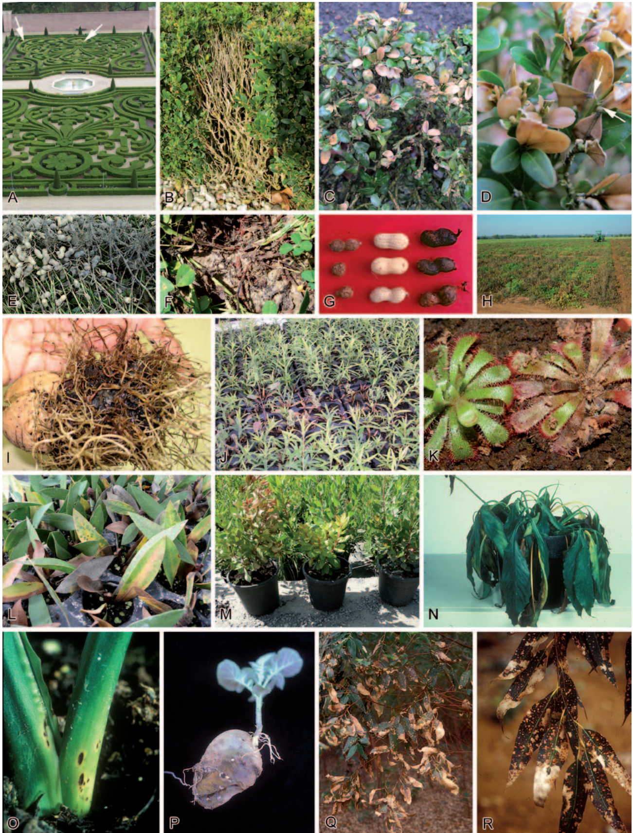
Fig. 2. Disease symptoms associated with Calonectria ( Cylindrocladium ). A–D. Defoliation and yellowing associated with Calonectria pseudonavicularata infection on Buxus sp. at Paleis Het Loo in the Netherlands (upper part of hedge in A, arrows). B–D. Leaf yellowing and defoliation (note detaching leaves in D, arrows). E–H. Calonectria illicicola causing Cylindrocladium black rot (CBR) on Arachis hypogaea in Georgia, U.S.A. F. Perithecia forming at the basal plant parts. G. Pods infected with tomato spotted wilt virus (left), healthy pods (middle), and pods infected with CBR (right). H. Field symptoms associated with CBR (photos with permission of T. Brennenman). I. Avocado roots infected with Ca. illicicola (photo with permission of L. Forsberg). J. Seeding blight of Callistemon citrinus associated with Ca. morganii (photo with permission of G. Polizzi). K. Seedling rot of Drosera sp. associated with Ca. pteridis infection. L. Leaf spots of Callistemon citrinus associated with Ca. pauciramosa (photo with permission of G. Polizzi). M. Arbutus unedo associated with Ca. pauciramosa infection (photo with permission of G. Polizzi). N–O. Root rot and petiole lesions of Spathiphyllum sp. associated with Ca. spathiphylli infection (photo with permission from the late N.E. El-Gholl). P. Potato tuber infected with Ca. brassicae . Q–R. Leaf blight of Eucalyptus sp. associated with a mixed infection of Ca. pteridis and Ca. ovata .