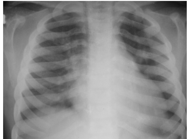
Figure 5 Anteroposterior chest X-ray showing paddle and/or spatulated ribs.

bones and tapering of the posterior ends of ribs (paddle and/or spatulated ribs) as well as his developmental history were all suggestive of MPS type II.