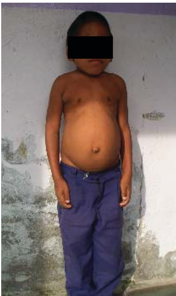
Figure 1 Child with mucopolysaccharidosis showing an acrocephalic head, coarse facial features, a depressed nasal bridge and a protuberant abdomen.

On examination his head was acrocephalic in shape, with a circumference of 54.5 cm. He had a depressed nasal bridge, a short neck, coarse facial features, small stubby fingers with flexion of the distal interphalangeal joint, and a low arched palate (Figure 1). Anthropometric examination showed him to be severely stunted without wasting. His fundus appeared normal. His abdomen was soft and slightly distended with a protruding umbilicus. His liver was 11 cm below the right costal margin in the