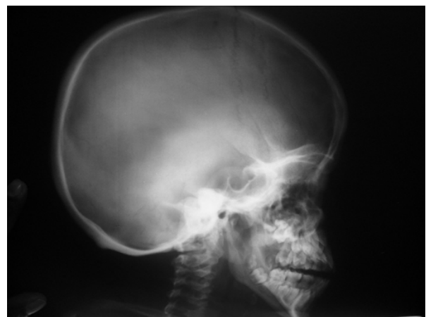
Figure 2 Anteroposterior and lateral X-ray of the skull showing a 'J' shaped sella turcica.

Although his radiological features were suggestive of MPS, without determining the type of MPS, from his history and clinical examination we have made a diagnosis of MPS type II (Hunter syndrome). However in our patient there was atypical presentation such as an acrocephalic head, mild mental retardation, and no corneal clouding, which are important features of MPS type II. Unfortunately we could not perform any measurement of GAG, keratan and heparan sulphates, in his urine because of the lack of test kits. Enzyme assay for iduronate sulfatase is not carried out in our laboratory therefore it was not performed either. Our diagnosis of MPS was confirmed from his history, clinical examination and skeletal survey.