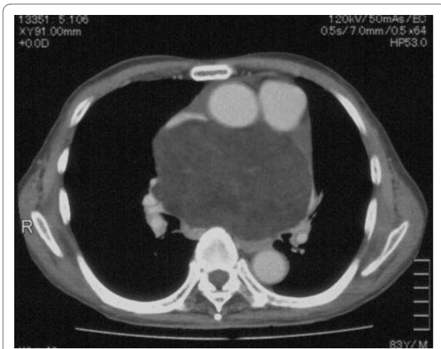
Figure 1 Computed tomography showed a large tumor behind the ascending aorta and pulmonary artery and compressing the right and left atria.

ing blood from the superior and inferior vena cava, ascending aorta and main pulmonary artery were cut. The tumor was encapsulated with a thin membrane and showed no invasion into surrounding tissues. A tight adhesion was observed in an extra-pericardial mediastinal fat tissue in the superior-posterior portion of the bifurcation of the right pulmonary artery. Except this portion, the tumor was relatively easily detached from surrounding tissues. A solid tumor encapsulated with a thin membrane was completely removed as a mass (Fig 2A). The tumor weighed 500 g (Fig 2B). The cut superior vena cava, ascending aorta and main pulmonary artery were reanastomosed. Extracorporeal circulation was discontinued without difficulty.