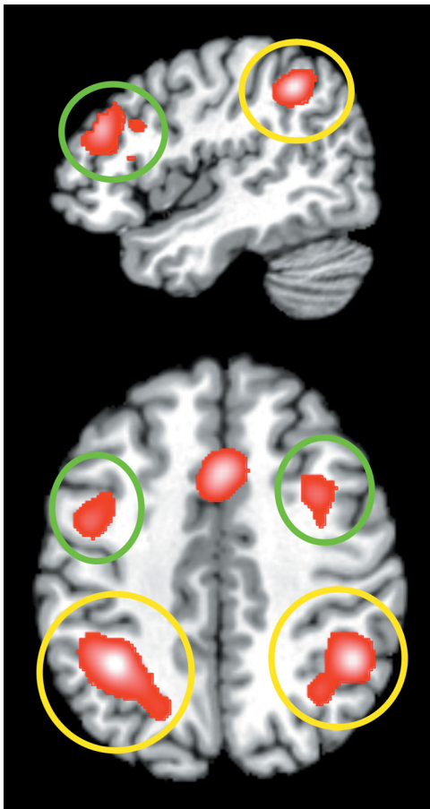
Figure 1. Regions of interest for gray matter density analyses: dorsolateral prefrontal and parietal lobes. Regions of activation are those identified through a meta-analysis of working memory functional MRI studies (Owen et al., 2005). The frontal and parietal regions assessed are indicated with circles.