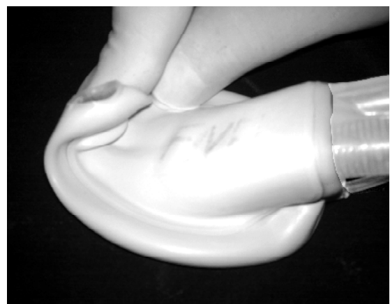
Fig 2 Posterior folding of mask

The advancing distal cuff of the PLMA gets folded (Fig 2) when it impacts against the posterior oropharyngeal wall thereby obliterating the lumen of the drain tube. 19,20 Thus the distal cuff folds up beneath the advancing cuff until the unfolded proximal cuff is redirected inferiorly into the laryngopharynx by the build up of the folded cuff in the oropharynx. The folded distal cuff cannot easily unfold as it gets wedged into the laryngopharynx. Folding over has also been reported with the cLMA, 28 but is probably more common with the PLMA due to its soft backplate. 26 This malposition may occur with both finger / introducer insertion and be associated with a better seal and higher mucosal pressures than the correctly placed PLMA.