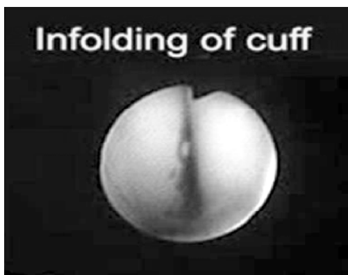
Fig 4 Cuff infolding

Cuff infolding refers to inward rotation of the large cuffs in front of the bowl so that they contact each other in the midline and obstruct gas flow (Fig 4). It is relatively uncommon and Stix reported 2 cases of cuff infolding out of 317 cases. 9,20 It is clinically indistinguishable from severe downfolding of epiglottis and both conditions may coexist at times. There is increased risk of cuff infolding with PLMA due to its deeper bowl and a more compliant cuff than that of the cLMA. 23