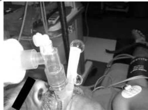
Fig 1 Gel displacement test leaking drain tube

Water-soluble gel (0.5-1 ml) is placed at the proximal end of the drain tube so that it forms a column of about 2-3 cm. Minimal movement or gentle up and down movements indicates a normal position. However, gel ejection with gentle positive pressure ventilation (PPV), indicates a leak from the drain tube, signifying improper seal of device with the hypopharynx (Fig 1). Thus, when positive, the test indicates airway leak through the drain tube. 1,2