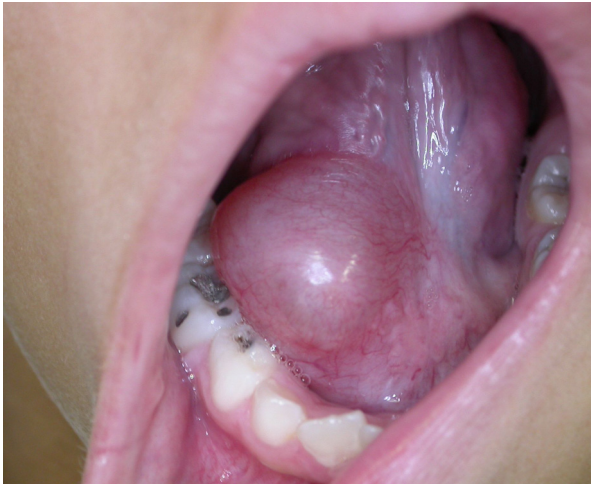
Figure 4 Asymptomatic turgid nodular lesion located on the floor of the mouth, measuring 4.0 cm in diameter.

gland of Blandin-Nuhn (ventral tongue) should not be considered rare. In their series, this type of mucocele was the second most frequent.