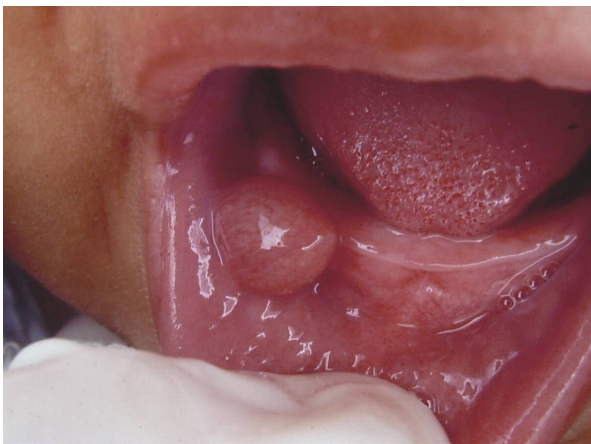
Figure 5 Turgid nodular lesion located on the lower lip of an infant.

In agreement with similar studies reported in the literature, in the present investigation 75.85% of the cases were diagnosed during the first and second decades of life, 49.42% of them during the second decade of life. Two