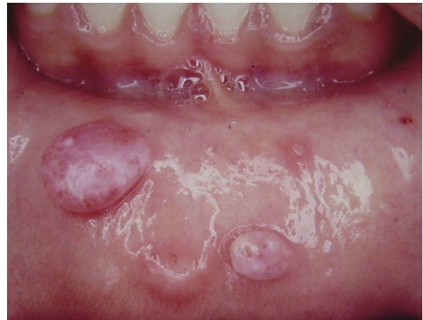
Figure 2 Turgid nodular lesions located on the lower lip.