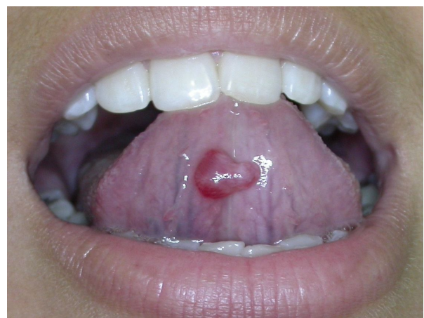
Figure 3 Mucocele of the gland of Blandin-Nuhn (ventral tongue). Pediculated turgid nodular lesion, measuring 3.0 cm in diameter.

When located on the ventral tongue, the differential diagnosis with lymphangioma must be considered. de Camargo Moraes et al.[19] state that mucocele of the