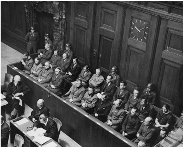
Fig. 4 Nuremberg Trial: the 23 defendants in dock during the doctors' trial.

The third cornerstone is consent: registration of the patient's decision and (written) consent [11, 24, 25].