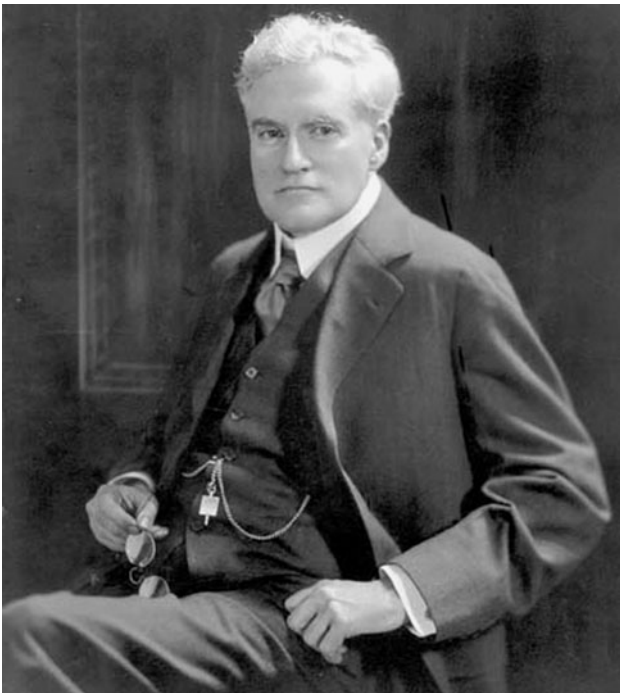
Fig. 3 Cardozo, Benjamin Nathan. Online photograph from the Encyclopædia Britannica. Available at http://www.britannica.com/eb/art-96738