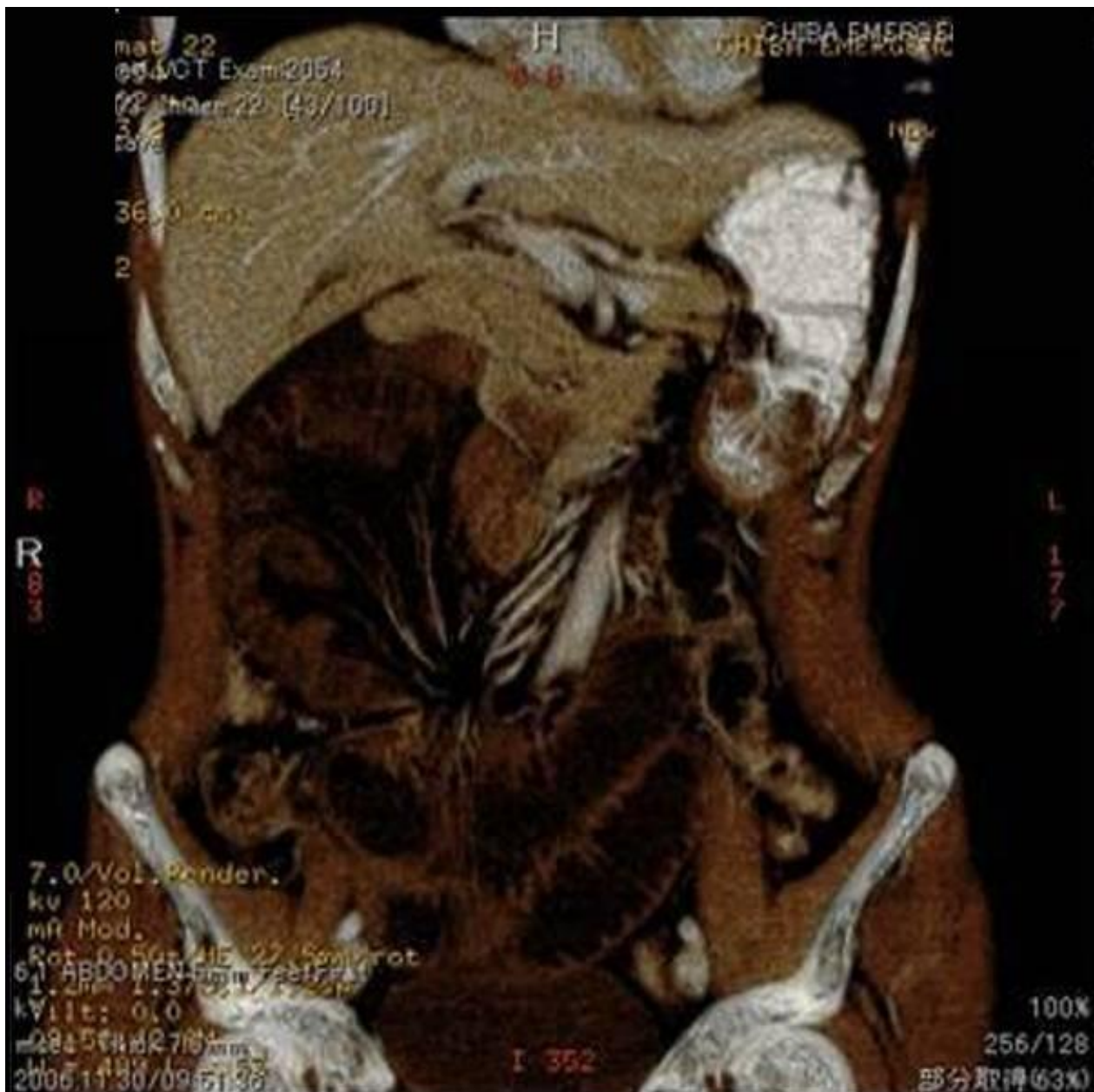
Figure 6 Retrospective multiplanar reconstructed enhanced multidetector-row computed tomography images reveal an abnormal cluster of digestive loops in the right lateral abdominal cavity and mesenteric vessel changes such as twisting and stretching.

angle. However, the post-operative enhanced MDCT revealed a narrow AMA, a short AMD, and the absence of bowel gas. We hypothesized that our patient had been suffering from RPH without complete bowel and vessel obstruction, so that the hernia cluster had kept the AMA wide. However, the repair of the hernia might have caused the AMA to narrow and squeeze the duodenal third portion, thus causing SMAS. In this case, reconstructed multiplanar images of enhanced MDCT allowed us to easily visualize and identify these diseases.