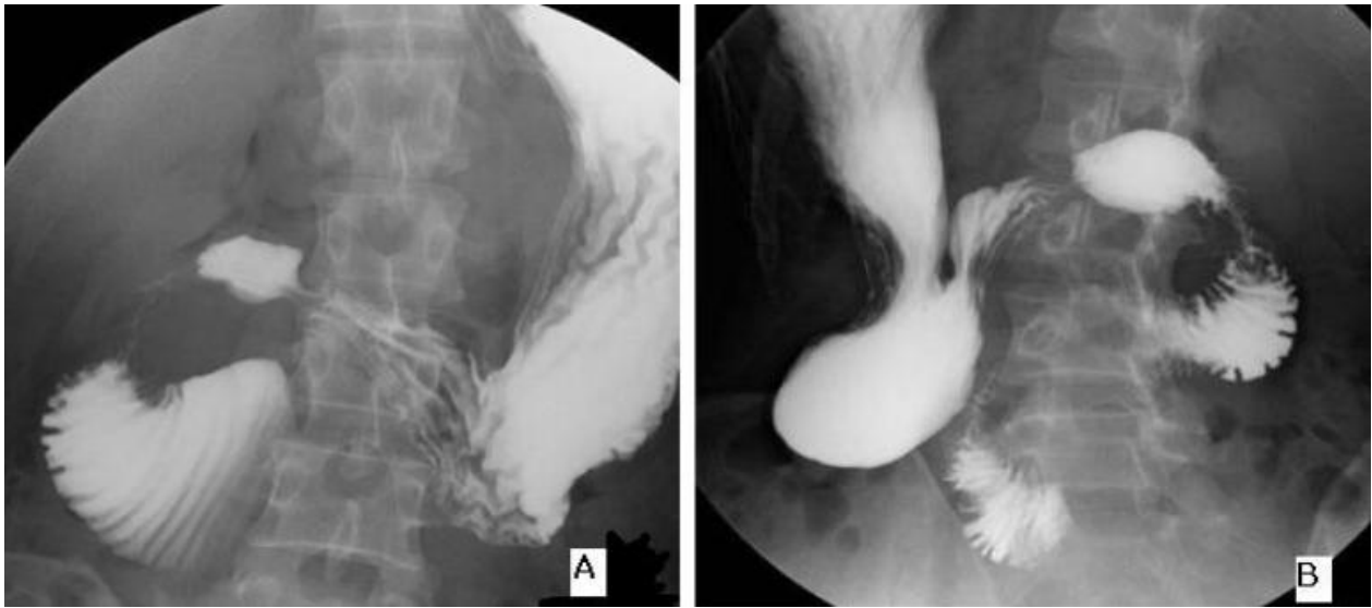
Figure 3 Upper gastrointestinal series shows: (A) Upper gastrointestinal series shows stricture of the duodenal third portion with a straight line cut-off sign in supine position. (B) In the prone position, the contrast medium passes through the obstructed part to the distal side of duodenal third portion.

An RPH represents a hernial sac entrapping the small intestine through the Waldeyer's fossa. The fossa is the first part of the mesentery of the jejunum, and is located inferior to the third portion of the duodenum and behind