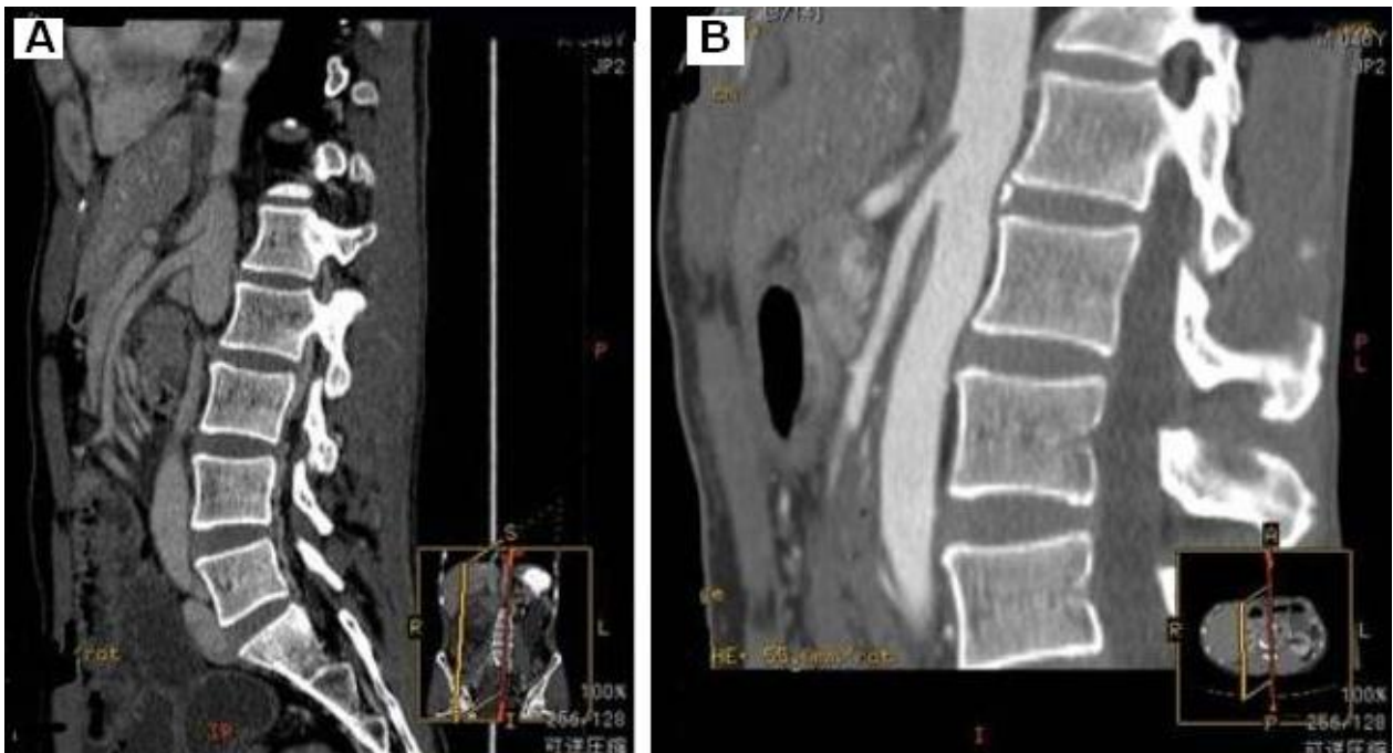
Figure 4 Reconstructed enhanced multidetector-row computed tomography reveals the following:(A) before the surgical repair of the right paraduodenal hernia, the aorto-mesenteric angle is 44°, and the aorto-mesenteric distance is 28 mm. There are intestinal gas bubbles under the aorto-mesenteric junction. (B) After the repair, the aorto-mesenteric angle has narrowed to 14°, and the aorto-mesenteric distance has shortened to 5 mm. Furthermore, no intestinal gas can be seen under the angle.

the superior mesenteric artery (SMA). This specific location is very important, because the bowel cluster that passes through the hernia orifice into the sac seems to lift up the SMA to a ventral position. As a result, the angle of