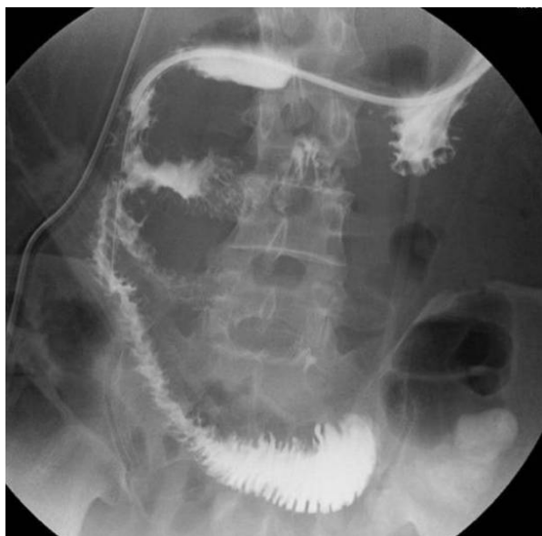
Figure 5 Post-operative upper gastrointestinal series shows good passage through the anastomosis.

the SMA to the aorta, which is the AMA, is probably wider than in the normal state. This is the reason why the surgical repair of RPH may have caused SMAS.