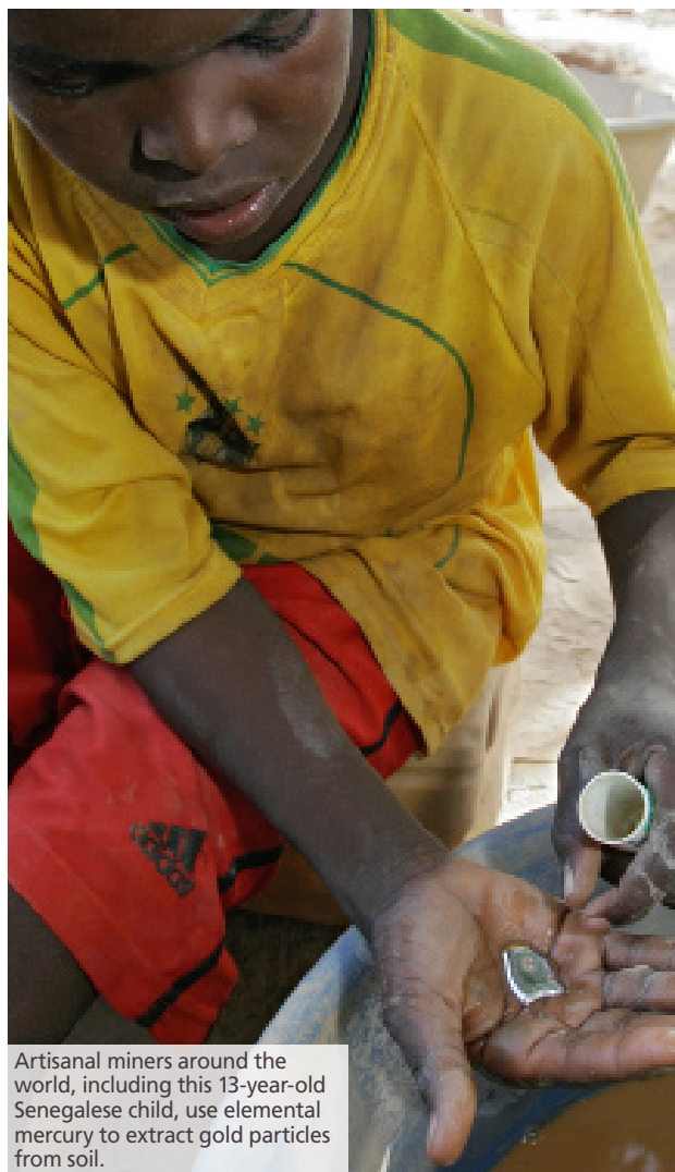
Artisanal miners around the world, including this 13-year-old Senegalese child, use elemental mercury to extract gold particles from soil.