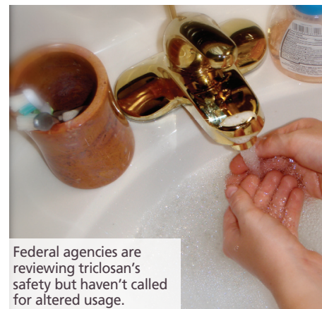
Federal agencies are reviewing triclosan's safety but haven't called for altered usage.