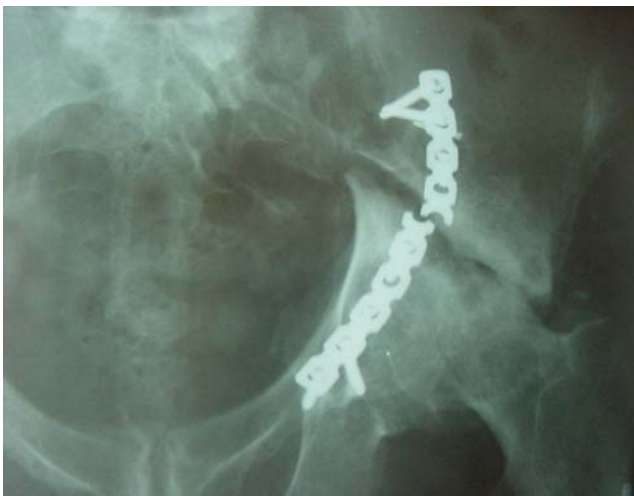
Fig. 2 Broken plate with non-union of the fracture. Note the broken drill bit

We believe that the anterior opening of the pelvic ring in the case of a floating acetabulum (Fig. 1a) is not associated with injury to the anterior interosseous sacroiliac ligaments, which is, otherwise, a standard pathology associated with