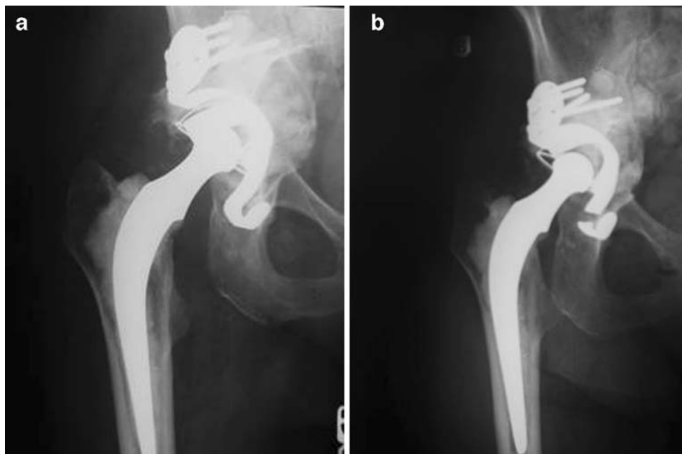
Fig. 1 a: Post-operative AP radiograph of the pelvis after allograft with a Kerboul ring. b: Radiographs at 5 years after the revision. The rupture of the ring is observed without instability of the implant

Between 1994 and 2000, 18 acetabular reconstructions with the use of freeze-dried irradiated allograft were done in 16 patients. One hip was lost because the patient could not be located. The remaining 17 hips (15 patients) have been followed clinically and radiographically for at least 5 years. There were ten women (66.6%) and five men (33.3%) with a mean age at surgery of 63 years (range, 50–80 years). One patient died more than 5 years after the revision. The indication for the revision hip arthroplasty was aseptic loosening of the acetabular component in 13 hips and polyethylene wear for 4 hips. The average age at the time of the first operation was 55 years. The mean follow-up was 7.8 years (range, 5–11 years). The pre-operative Merle d'Aubigné/Postel score was 10.3 (5–18). At 3 months, this score was 15.2 (12–18). At 1 year, it was 16.2 (15–18), and at 5 years it was 17.2 (16–18). The pre-operative acetabular radiological defects were classified according to the AAOS classification as type I (n=5), type II (n=5) and type III (n=7). We used five Kerboul rings, two steel meshes and ten cemented isolated allografts. We recorded one early