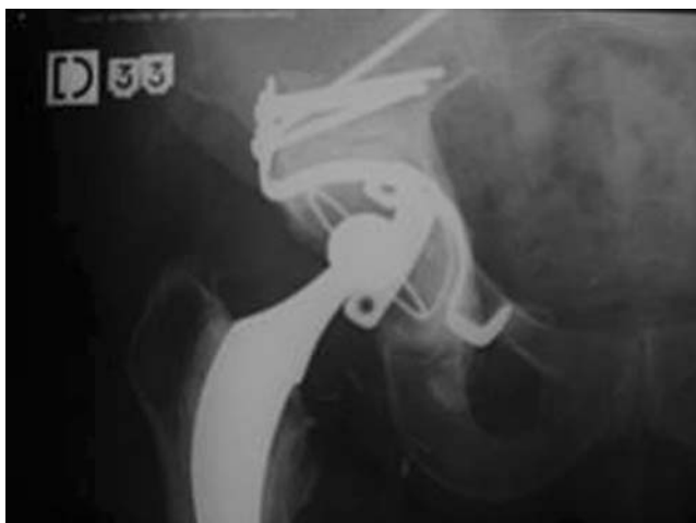
Fig. 3 Postoperative AP radiograph of the pelvis showing complete and stable reconstruction of a Type-II defect six years after surgery. The component is stable and well-fixed

dislocation without further revision (in recovery room), one haematoma requiring a surgical procedure and two venous thromboses without pulmonary embolism that resolved under treatment. Two patients had moderate peri-acetabular ossifications classified Brooker I. No hip required further revision of the acetabular component after our surgical procedure at the last follow-up. We observed a rupture of one Kerboul ring, without instability of the implant (Fig. 1). Radiographic evaluation after 5 years (as defined by DeLee and Charnley) shows that allografts were replaced by new bone formation with a trabecular structure of the bone for six hips, ten hips have a radiological demarcation <2 mm diameter at the defect margins without instability of the implant, and a patient has a marginal lucency type I of approximately 5 mm around the implant without clinical symptomatology (Fig. 2).