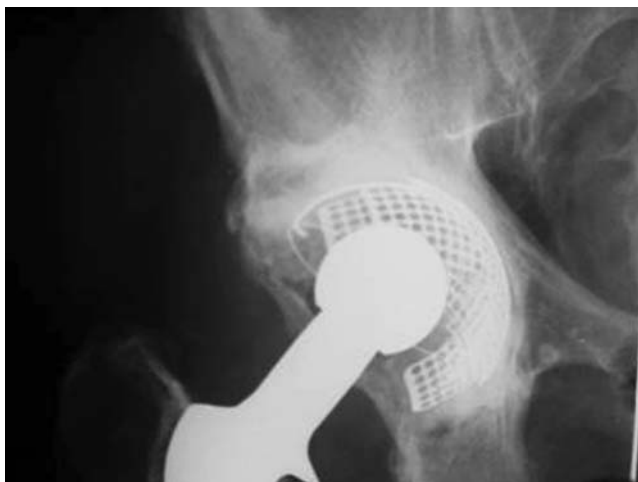
Fig. 2 Radiograph obtained 7 years post-operatively of a patient who had a cemented implant with a metal mesh and allograft. There is a small marginal lucency. The hip continues to function well

dislocation without further revision (in recovery room), one haematoma requiring a surgical procedure and two venous thromboses without pulmonary embolism that resolved under treatment. Two patients had moderate peri-acetabular ossifications classified Brooker I. No hip required further revision of the acetabular component after our surgical procedure at the last follow-up. We observed a rupture of one Kerboul ring, without instability of the implant (Fig. 1). Radiographic evaluation after 5 years (as defined by DeLee and Charnley) shows that allografts were replaced by new bone formation with a trabecular structure of the bone for six hips, ten hips have a radiological demarcation <2 mm diameter at the defect margins without instability of the implant, and a patient has a marginal lucency type I of approximately 5 mm around the implant without clinical symptomatology (Fig. 2).