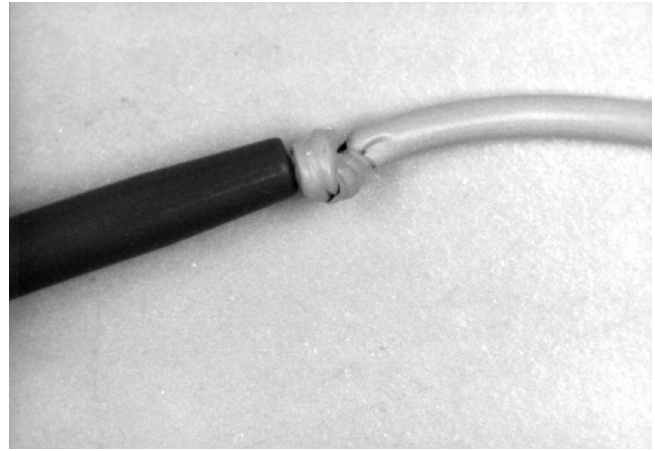
Tracheostomy dilator and pulmonary artery catheter after removal.

Bjaeverskov, Denmark) was inserted over the remaining part of the catheter without encountering any resistance. The catheter was carefully withdrawn until the knot reached the end of the dilator. There the knot was pulled tighter, but could not be retracted into the dilator. The knot had approximately the same circumference as the middle part of the dilator, however, and together they were removed without the occurrence of any further complications (Fig 2).