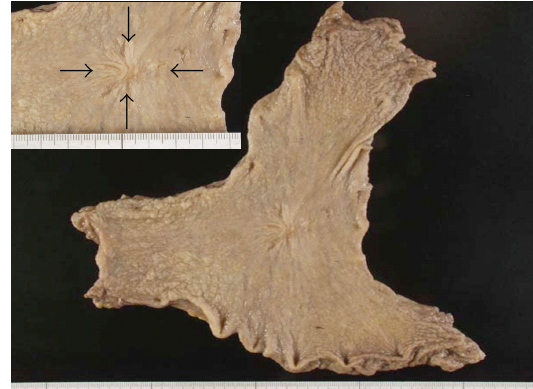
FIGURE 3: A macroscopic examination of the resected specimen showed an irregular depressed lesion (type IIc), measuring 3.0 \times 2.5 cm (arrows), in the lesser curvature of the middle portion of the stomach.

A totally laparoscopic distal gastrectomy with lymph node dissection (D2) was performed. The procedures were done according to the method described by Kanaya et al. [9]. To perform pneumoperitoneum and operate the devices, five trocars were inserted into the peritoneal cavity, while carefully avoiding the skin tumors. Following the gastrectomy, the lymphadenectomy, and the reconstruction were all done intra-abdominally. After mobilization of the gastroduodenum and a sufficient lymphadenectomy, the duodenum and the stomach were transected using endoscopic linear staplers (ETS Flex 45-3.5, Ethicon EndoSurgery, Cincinnati, OH, USA). The resected specimen was removed out through the extended umbilical incision using a plastic tissue bag. A Billroth I gastroduodenostomy was performed by making delta-shaped anastomosis using the endoscopic linear staplers (Figure 1). The operation was