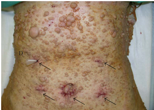
FIGURE 2: Many cutaneous neurofibromas crowded on the abdomen, especially epigastric area. All incisions (arrows) were small, and the operation was finished without injuring the skin tumors. D: drain.

neurofibromas) on all of the body surfaces, including the abdominal wall. The results of the laboratory tests were unremarkable, except for a white blood cell count of 3000/\text{mm}^3 . Tumor markers, including CEA and CA19-9, were within normal limits. Abdominal ultrasonography and computed tomography revealed no signs of metastasis.