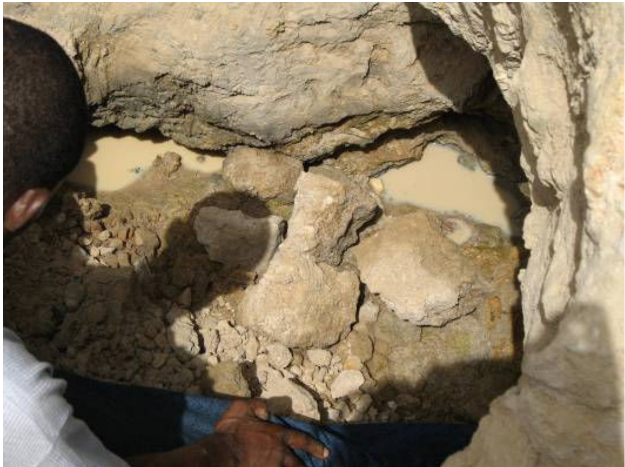
Figure 3 Brick-hole in Zongo district

did not vary significantly between districts. However the M form predominated slightly ( \chi^2 = 6.97 , df = 3 P > 0.05 ). The proportion of each species between April and October 2006 as significantly different ( \chi^2 = 10.23 , df = 2 P < 0.01 ).