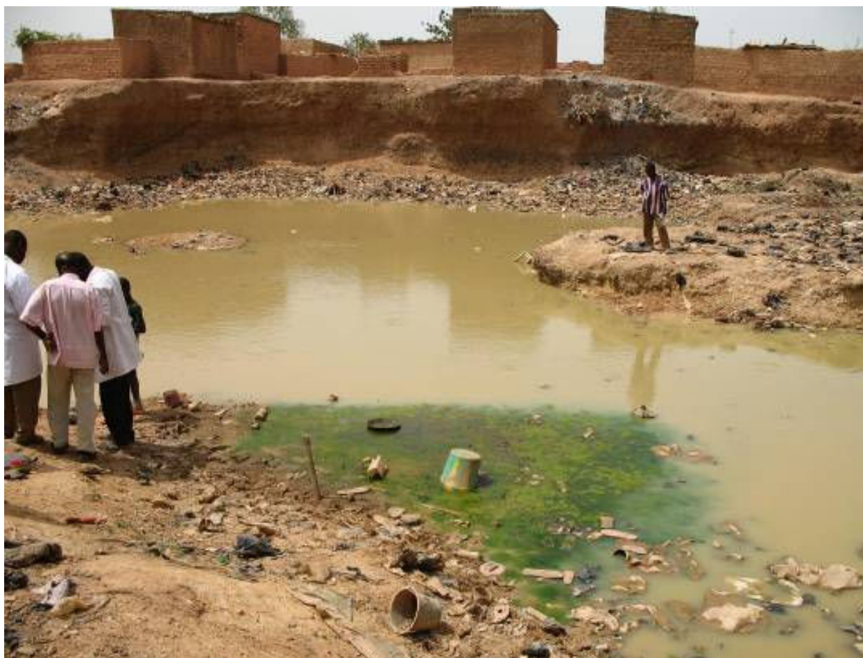
Figure 4 Polluted breeding site in Yamtenga district