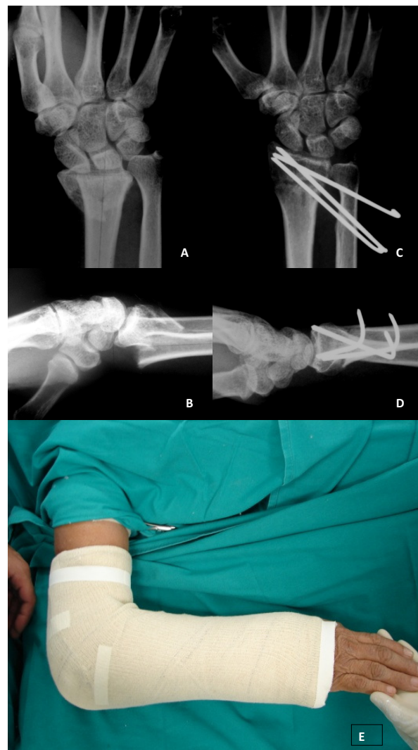
Figure 1 Modified De Palma technique of percutaneous pinning.

We used a bridging external linear fixator (Biomechanica®). Its placement started with the installation of two proximal pins. Longitudinal incisions of around 1 cm were made and the protective soft-tissue guide was introduced by means of blunt dissection. This was positioned at an angle of approximately 90 degrees to the coronal plane of the forearm. We then introduced two self-tap-