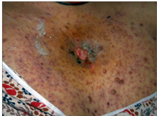
Figure 3: Clinical photograph of the same patient showing ulcerated lesion over the sternum with varicella rashes