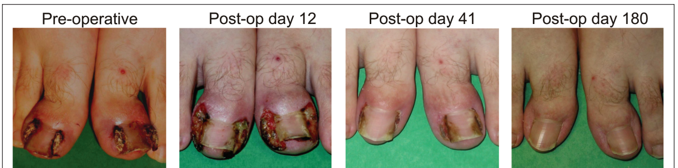
Fig. 3. Images showing healing by secondary intention following surgical nail-fold excision. Post-op = postoperative.