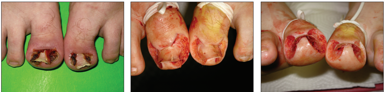
Fig. 1. Examples of the severity of ingrown toenails surgically corrected by soft-tissue nail-fold excision. The preoperative appearance (left) highlights the extensive medial and lateral nail-fold granulation tissue. The images obtained in the postoperative period (centre, right) show the surgical site following nail-fold excision. The excision of soft tissue was typically generous and adequate, with all portions of the granulation tissue removed.

Mesh tulle gauze ( 10 \times 10 cm) was folded and applied over the site of the excision followed by 2 gauze pads ( 5 \times 5 cm) and a snug dressing of rolled gauze (5-cm width). The patients were instructed to soak their feet after 48 hours in a warm water bath for 15–20 minutes, during which time the dressings were removed and replaced with new clean dressings. Patients were instructed to subsequently soak their toes 3 times per day for 15–20 minutes in a warm water bath for 4–6 weeks. Pain control was achieved with