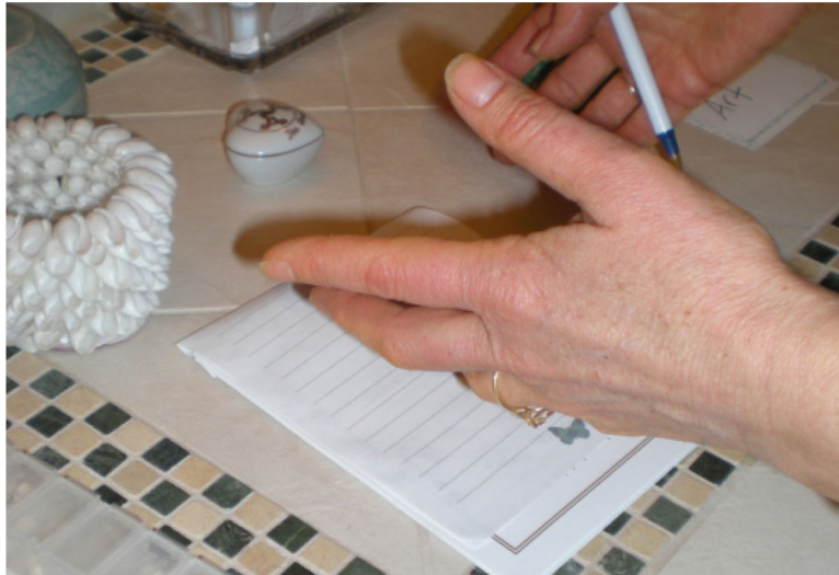
Figure 3. P4 left a notepad in the bathroom because questions for the doctor often came to her there.