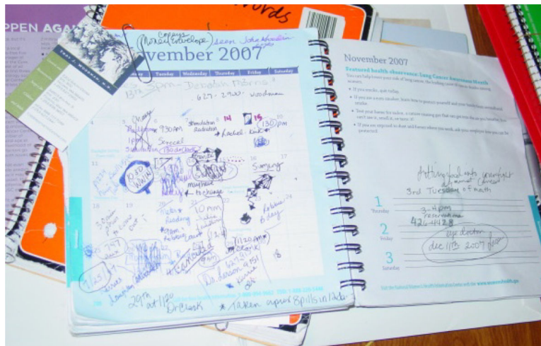
Figure 2. P3's mobile reference collection included her calendar, business cards, and notes.