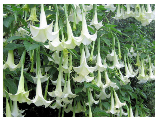
Figure 2 Datura suaveolens .

Our patient had no neurologic symptoms, there was no ptosis nor an ocular motility deficit. However, a cerebral MRI was performed to exclude a compressive origin of palsy even if the level of suspicion of this cause was very low.