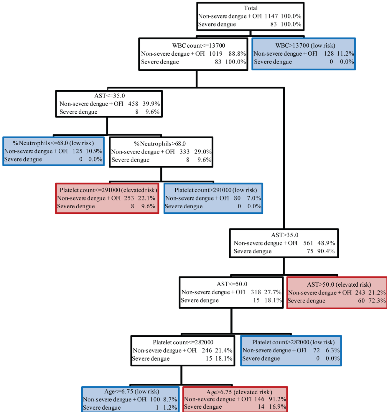
Figure 2. CART algorithm #2 for identifying patients who subsequently developed severe dengue (defined as WHO criteria for dengue shock syndrome, DSS, or dengue with significant pleural effusion) using clinical laboratory data obtained within the first three days of illness. Pleural effusion index (PEI) > 15 was used as the criterion for significant pleural effusion. Each node is shown with the selected splitting variable, the number of patients with severe/non-severe or OFI, and the proportion of each from the parent node. Terminal nodes are marked as 'elevated risk' of severe dengue illness, outlined in red, and 'low risk' of severe dengue, outlined in blue. doi:10.1371/journal.pntd.0000769.g002

disease. A more recent decision tree study by Lee and colleagues found a history of clinical bleeding, serum urea and serum protein to distinguish between patients with DF and patients with DHF; however, both studies have limited clinical utility as a predictive algorithm for patients with severe dengue because virologic confirmation of dengue infection is not known at presentation