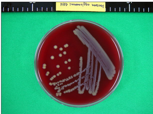
Fig. 3. Pantoea agglomerans was isolated in the vitreous culture. Yellow pigment-producing colonies that were 2 mm in size, non-hemolytic, and convex were detected on a blood agar plate.

pected ocular fungal infection. Despite this treatment, the anterior chamber reaction and fundus findings deteriorated. Five days after the initial intravitreal injection, visual acuity of the right eye had decreased to hand motion. A hypopyon had also developed in the right eye (Fig. 2).