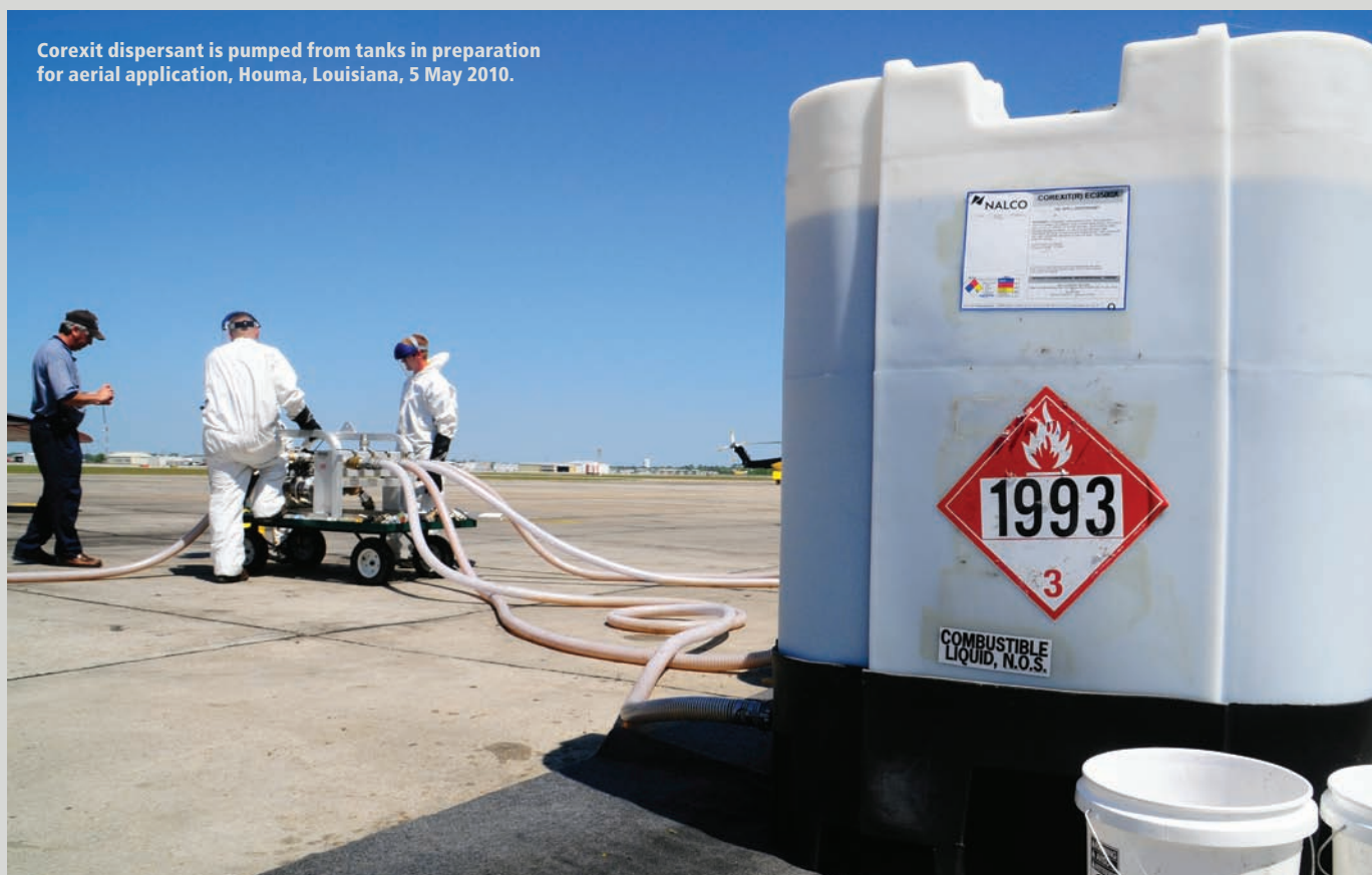
Corexit dispersant is pumped from tanks in preparation for aerial application, Houma, Louisiana, 5 May 2010.

spill, Corexit® 9500 and 9527, are manufactured by Nalco, a company based in Sugar Land, Texas. The Material Safety Data Sheet (MSDS) for each dispersant indicates they contain one of two solvents: 2-butoxyethanol (2-BE), found in Corexit 9527 11 —an older product dating back to the 1970s—or petroleum distillates, found in the newer Corexit 9500 12 product. The Corexit dispersants also contain organic sulfonic acid salt (a surfactant) and propylene glycol (a stabilizer).