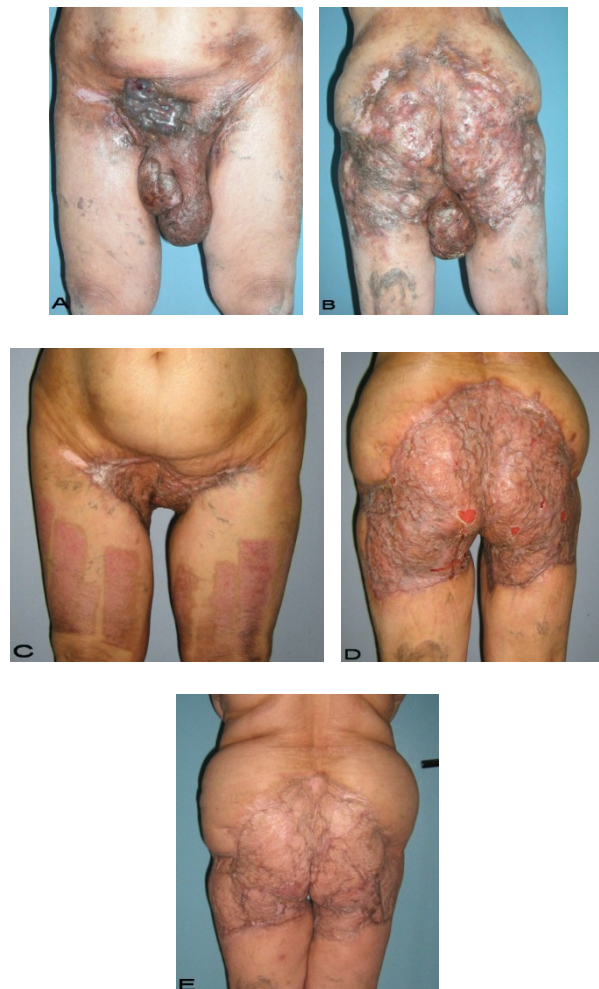
Figure 2: Patient 10. A 57-year-old female patient with very severe widespread Hidradenitis suppurativa. (A,B) Preoperative view of inguinal, perineal and gluteal areas. (C,D) Postoperative results after 6 month. (E) View of postoperative 3 year.

57-year old female patient. 30 years ago a lesion was excised from the coccygeal region but recurred 10 years later and treatment with retinoids was started. However the lesions relapsed and disseminated to a wide area over time (Figure 2). The lesions of this patient were very extensive and drastic which are rare in the literature and especially the effects of the disease on the perineal area was dramatic. Both gluteal areas, perianal, perineal, inguinal and axillary regions were affected. The lesion on right labia majora was enlarged to 10x15 cm and left labia majora was 10x20 cm. Surgical treatment was performed in 3 stages. At the first stage all perineal and gluteal lesions were excised with at least 1 cm margins. The size of the excised material from the gluteal region was 42x40 cm. Split thickness skin grafts from the thigh were used for reconstruction. Excision and primary closure of the axillary lesions were done in second and third stages. We obtained excellent functional results (convenience during urination etc.) and moderate cosmetic results.