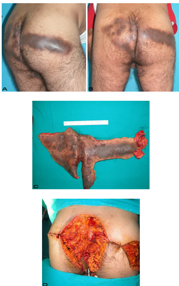
Figure 5. Patient 9. A 47-year-old male (A,B) Gluteal and perianal region before treatment, showing multiple confluent suppurative and inflammatory nodules. Extraordinary widespread of HS in the right gluteal area. (C) Excision material of lesion. (D) View of defect after excision.

used in 13 axillary regions and 10 fasciocutaneous flaps from the parascapular region were used. 4 flaps were thoracodorsal perforator based. In 2 patients with bilateral axillary disease, bilateral excision and thoracodorsal perforator based flap reconstructions were performed at a single stage. To preserve the shoulder movements and to prevent contactures, skin grafts were not used for the reconstruction of the wide axillary defects. Five of the perineal defects were closed primarily, 4 were by skin grafting, 3 by fasciocutaneous transposition flaps and one perineal defect was closed by gracilis myocutaneous flap. Inguinal region reconstruction was done by primary closure in 6 patients, and fasciocutaneous transposition flap was used for 1 patient.