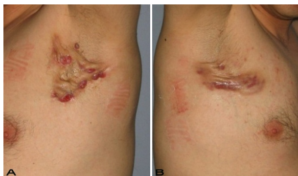
Figure 3. Patient 14. A 24-year-old male. (A,B) Preoperative view of axillary region. (C,D) The axillary defect is covered with toracodorsal perforator based fasciocutaneous flaps. (Intraoperative view)