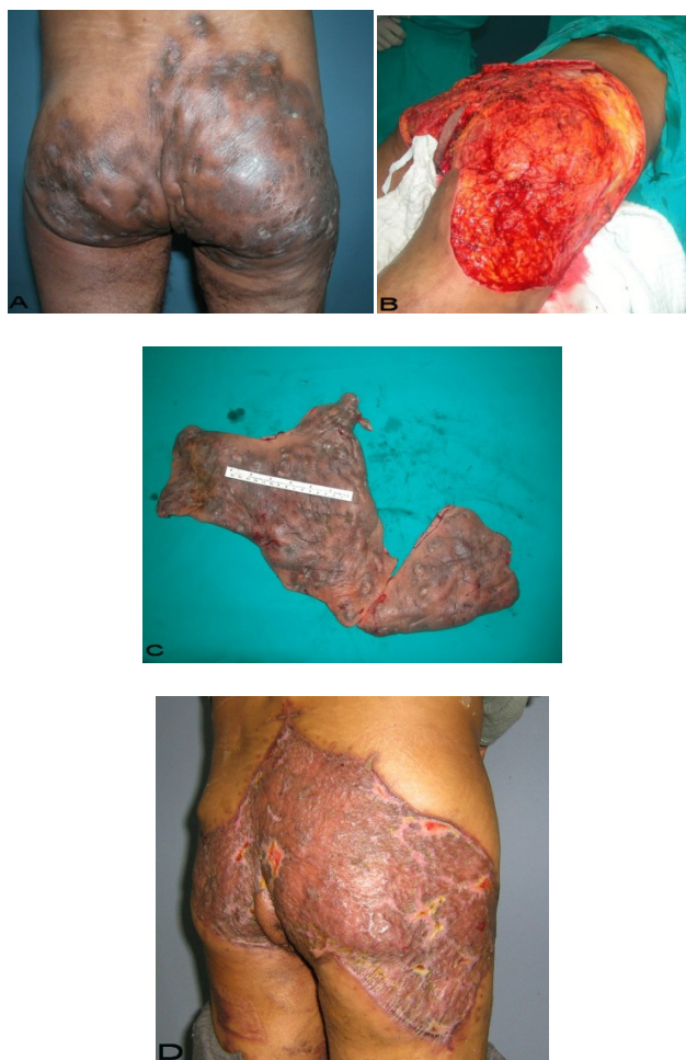
Figure 6. Patient 12. A 51-year-old male patient with spread and severe gluteal and perianal HS. (A) Preoperative view with multiple fistulas in the gluteal area. (B) After excision of the inflammatory region. (C) View of excision material. (D) Postoperative result after 6 months.

The duration time of hospitalization was related with the extent and severity of the lesions and the mean hospitalization was 6 days (3-41days). All patients were followed with daily dressing changes. All flaps survived totally except for minor distal marginal flap necrosis in 2 parascapular flaps which were treated by simple suturation.