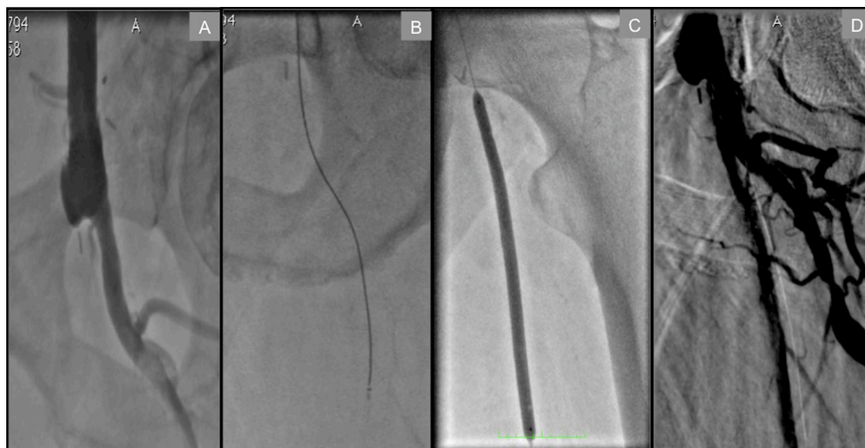
Figure 1 Transradial approach to a left proximal SFA total occlusion in a patient with a history of aorto-bifemoral bypass. A) Distal anastomosis site of bypass conduit to CFA and total occlusion of SFA at its ostium. B) Crosser CTO recanalization catheter™ (Flowcardia) successfully passing through proximal total occlusion. C) Balloon angioplasty of proximal SFA. D) Final result at the end of procedure.

Individuals who have undergone previous surgical revascularization, particularly aorto-bifemoral bypass, pose a unique challenge in that the two bypass conduits usually form an acute angle from their anastomotic take-off