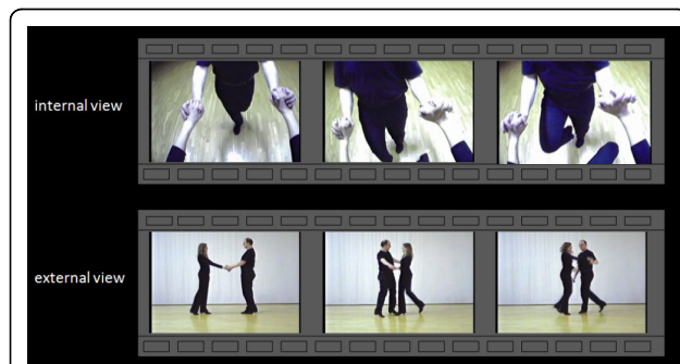
Figure 2 Example of stimulation. Example of stimulation (upper line: internal view, lower line: external view).

Brain images were acquired using a 1.5 Tesla system (Siemens, Erlangen, Germany) with a standard head coil. A total of 805 T2*-weighted images were acquired (echoplanar imaging: repetition time = 2500 ms, echo time = 55 ms, matrix: 64 \times 64 ). Structural image acquisition consisted of 160 T1-weighted sagittal images (1 mm slice thickness). All preprocessing analyses were carried out with SPM5 (Wellcome Department of Cognitive Neurology, London, UK). Volumes were realigned and unwarped, slice-time corrected, normalized to Montreal Neurological Institute (MNI) space, and smoothed with a 9-mm Gaussian isotropic kernel. All observation periods were modeled using a canonical hemodynamic response function with a duration matched to the video and picture presentation length. Data were high-pass filtered (cutoff = 256 s). Serial correlations were accounted for by an autoregressive (1) process. The four experimental conditions (IV, EV, SIV, SEV) were entered into