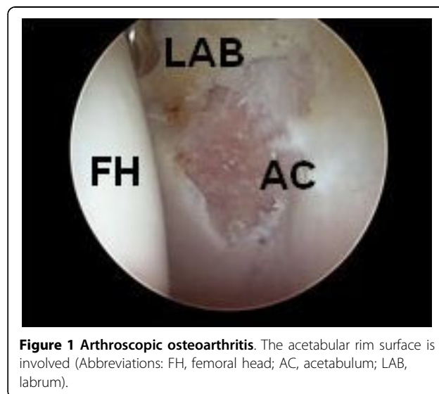
Figure 1 Arthroscopic osteoarthritis. The acetabular rim surface is involved (Abbreviations: FH, femoral head; AC, acetabulum; LAB, labrum).

Overall, 564 hip arthroscopies done for OA were included in the study (Figure 2). We found that 90 of them (16%) deteriorated to hip replacements between the years of 2002 to 2009. The survival probability (SP) to avoid THA was calculated with the Cox regression model. At one year after the index arthroscopic operation the SP was 94% (p = 0.002), at 3 years was 88% (p = 0.005) and at 6 years was 84% (p = 0.007). There were 35 males and 55 females. The mean age was 55