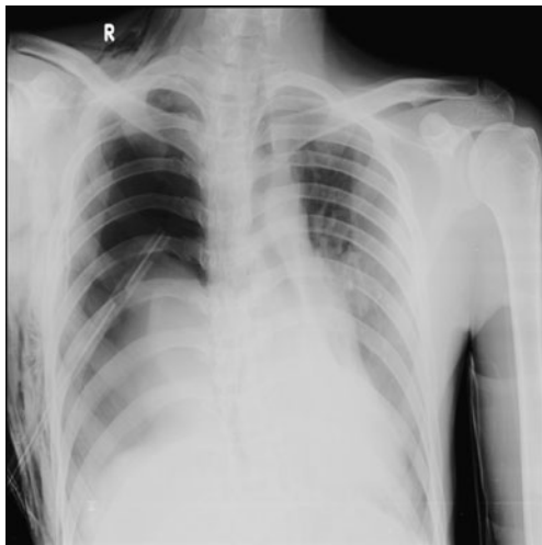
Fig. 1 Plain chest radiograph showing right-sided tension pneumothorax, collapsed right lung, ICD in situ, mediastinum and tracheal shift to left

sought and they advised immediate surgical repair with a possibility of right pneumonectomy as the bronchial defect was large. It was a case with high risk and poor prognosis, as the left lung too was contused extensively. The need for emergency surgery and prognosis were explained to the patient's relatives, but they were not willing to give consent for further management; hence, the patient was discharged against medical advice.