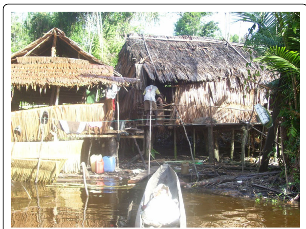
Figure 2 Bewak.