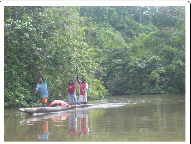
Figure 3 Kolekole.