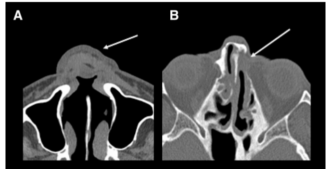
FIGURE 2. A , Axial computed tomography (CT) scan of a patient showing diffuse thickening of the nasal wings with collapse of the nasal pyramid (arrow) and erosion of the nasal septum. B , Axial CT scan of another patient showing erosion of the nasal septum and obliteration of the left nasolacrimal duct (arrow) and thickening of the bony walls of the paranasal sinuses.

The mucosal thickening described is a CT finding that suggests chronic rhinosinusitis. This entity occurs in 16% of the American population, and is the second most common chronic disease in this population. 13,14